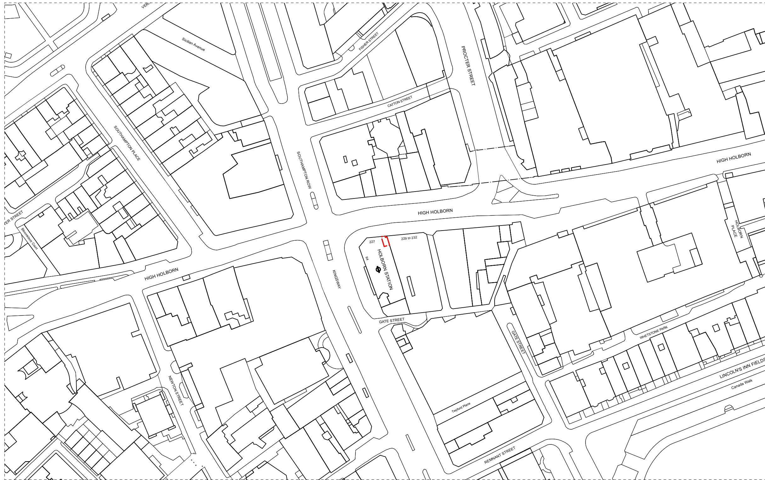
1 Site Location Plan 1:1250@A3