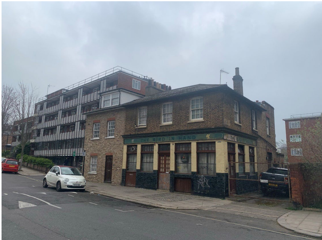
Image 1: Looking south towards the former Bird in Hand public house which has occupied the Site since the early 1800's.

After about 170 years, the Bird in Hand closed in 2003, when an application to demolish and replace it with a block of seven flats was refused. 5