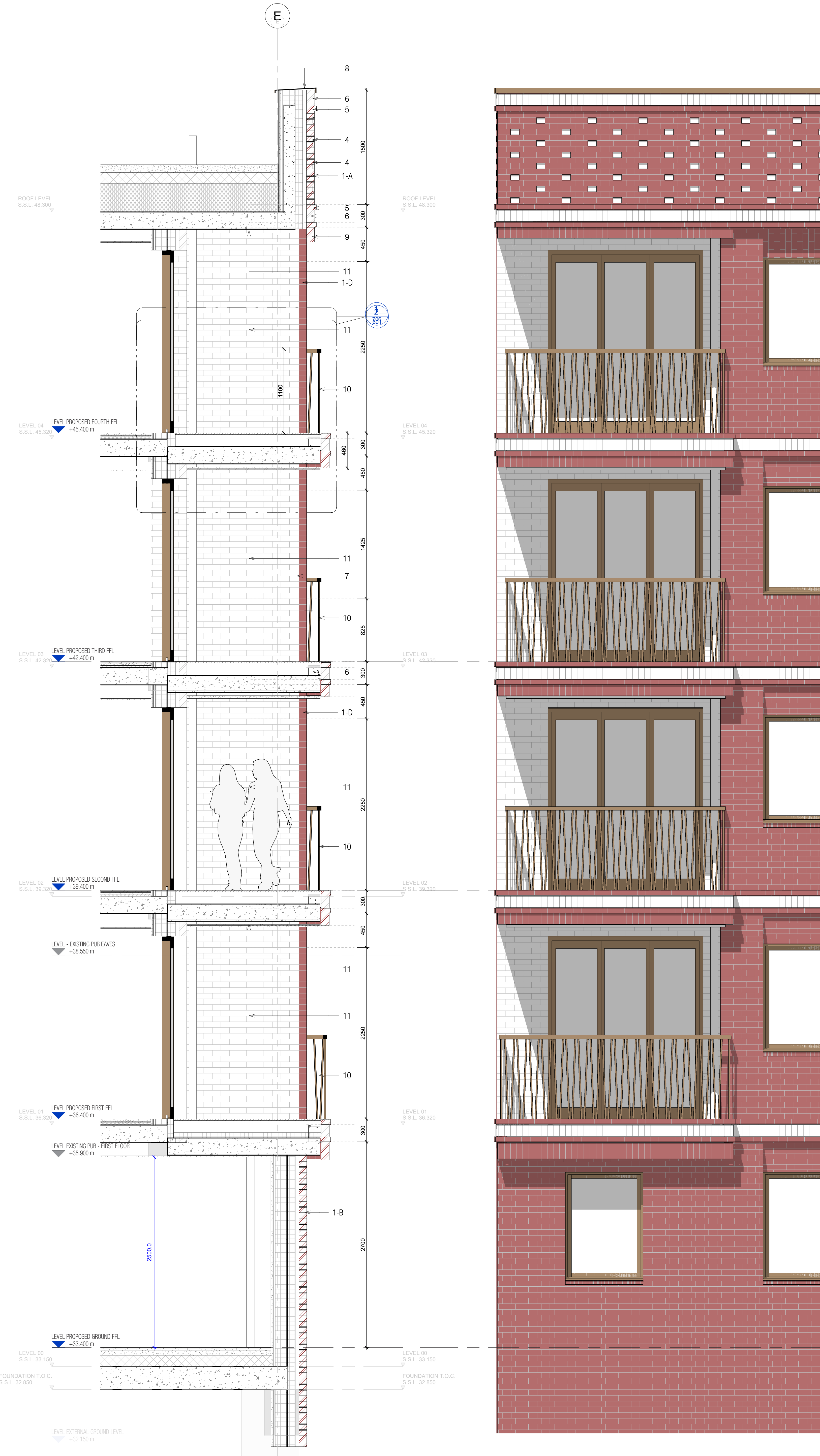
Facade Detail 2 Section