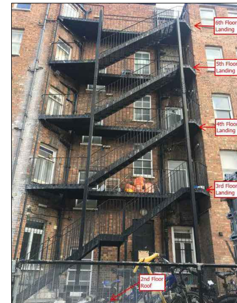
EXISTING/PROPOSED REAR ELEVATION 1:100 @ A1