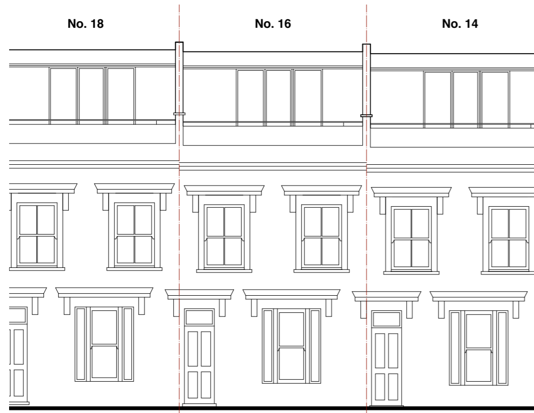
1 EXISTING QUADRANT GROVE ELEVATION