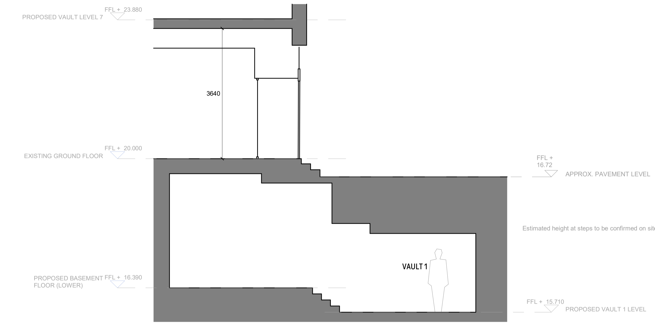
2 PROPOSED SECTION C-C - VAULT 1 1:50