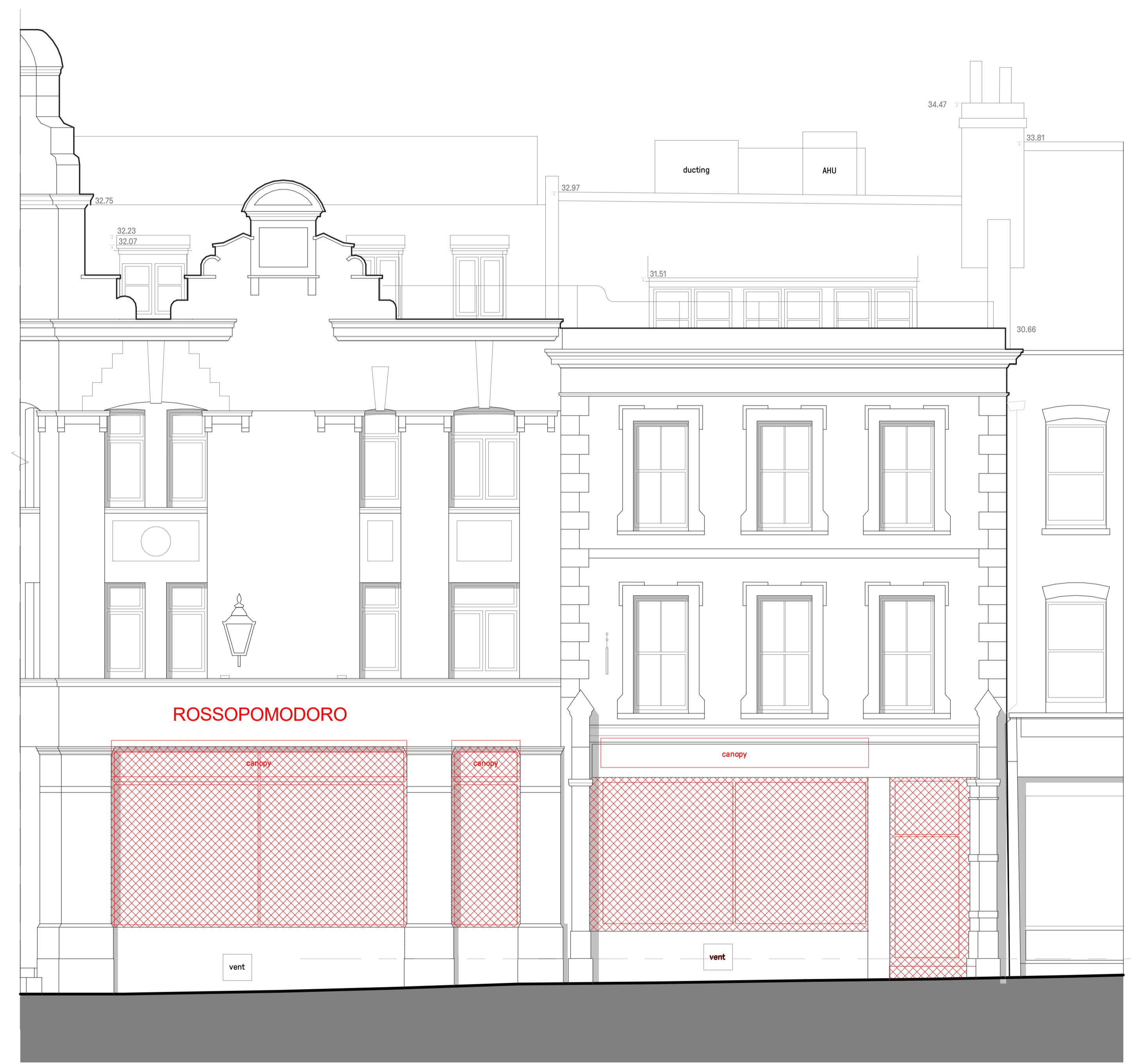
2 DEMOLITION ELEVATION - MONMOUTH STREET 1:50