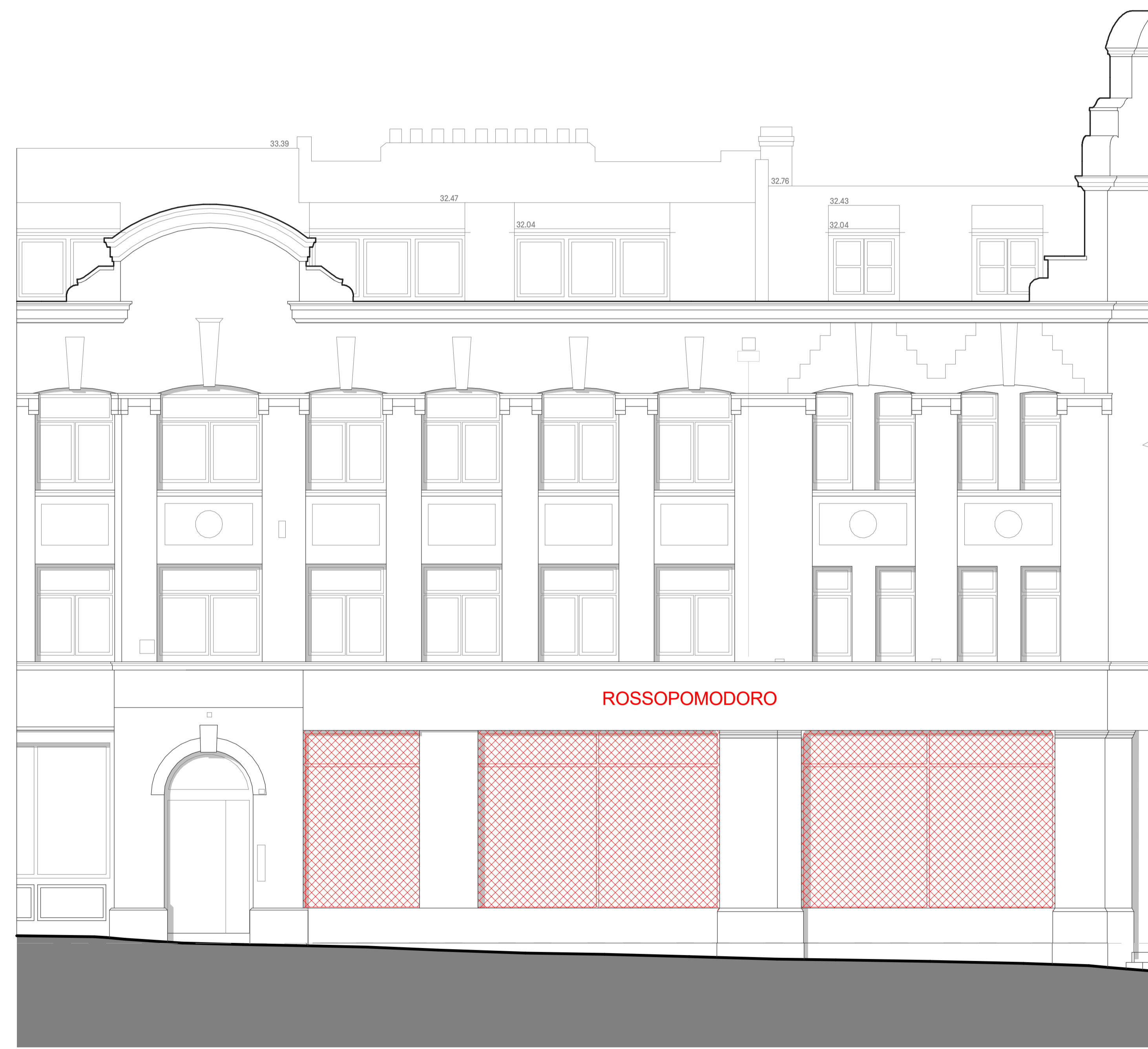
1 DEMOLITION ELEVATION - TOWER STREET 1 : 50

Canopy removed and existing facade prepared to accommodate new signage and awnings