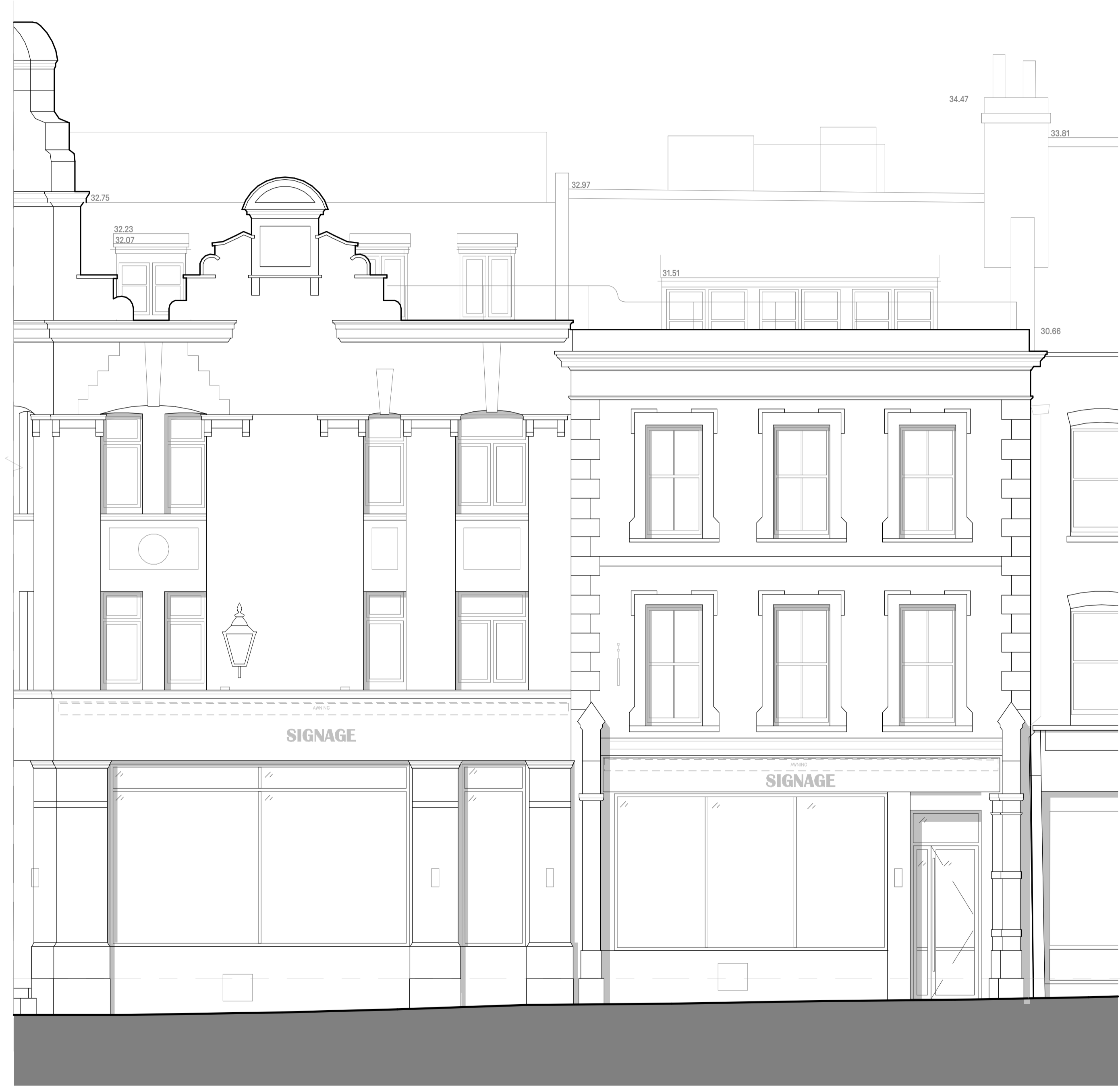
2 PROPOSED MONMOUTH STREET ELEVATION 1:50