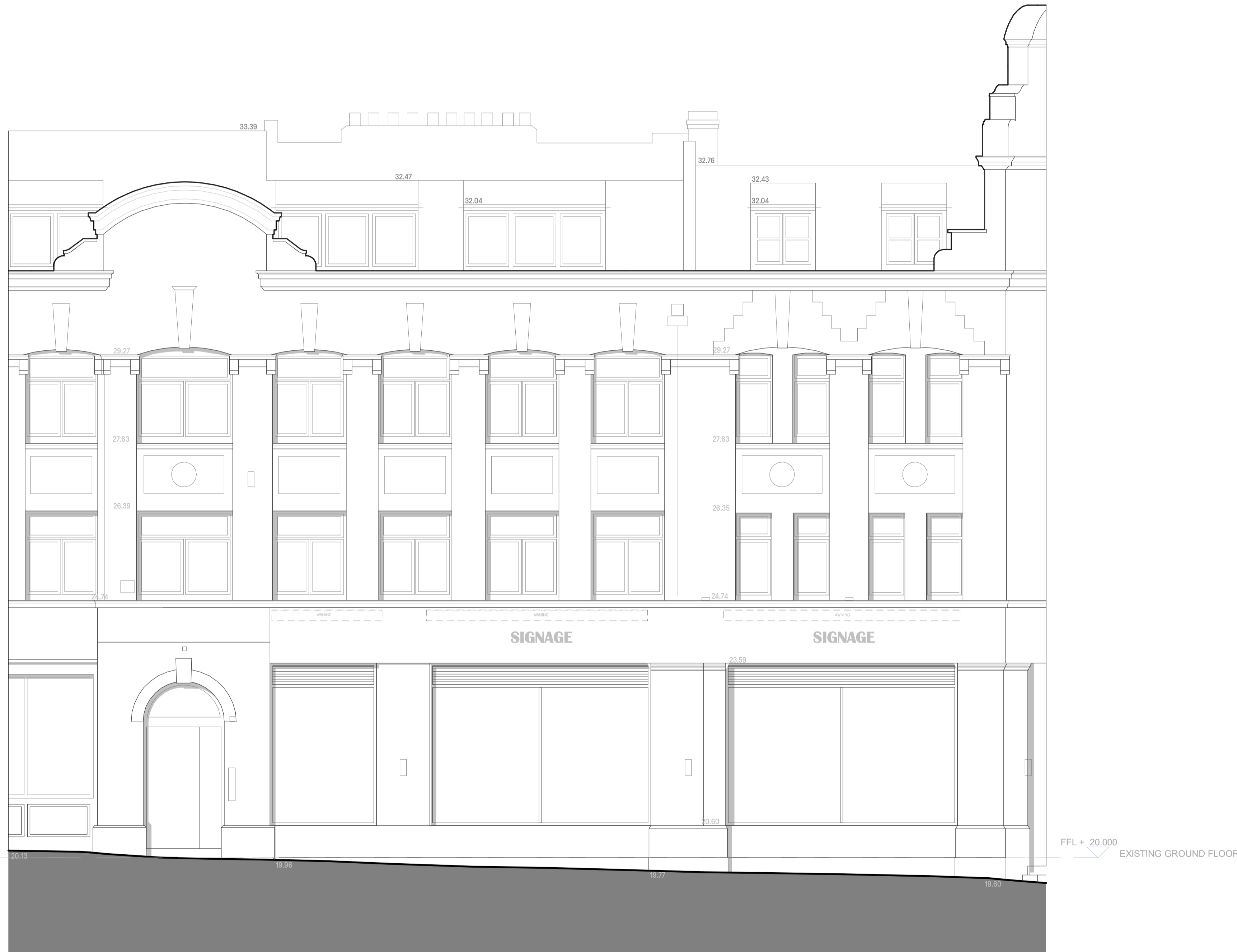
1 PROPOSED TOWER STREET ELEVATION 1:50

Notes: All drawings are subject to detailed design development, dimensional checking of critical dimensions, input from the wider design team, statutory consents and client review and approval. All existing and proposed drawings are based upon survey information provided by others. Whilst every reasonable care has been taken to verify such information CGL cannot be held liable for its veracity or accuracy. All dimensions are to be checked on site prior to the commencement of fabrication.