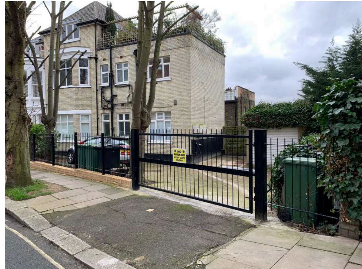
Photo from Hilltop Road View of existing vehicle gate and boundary railing/dwarf wall