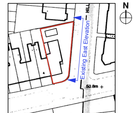
Key Plan 1.1250