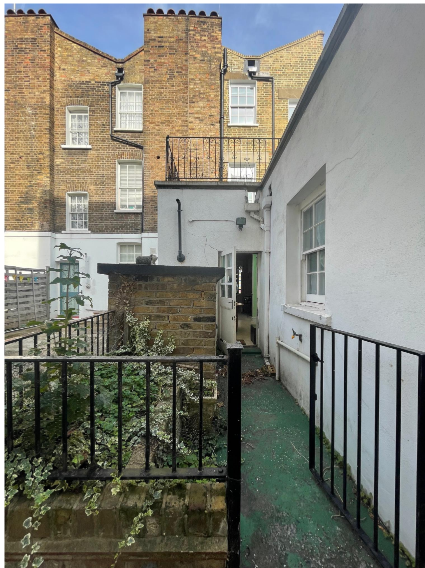
1 View from private shared pathway to rear of 26 Medburn Street.