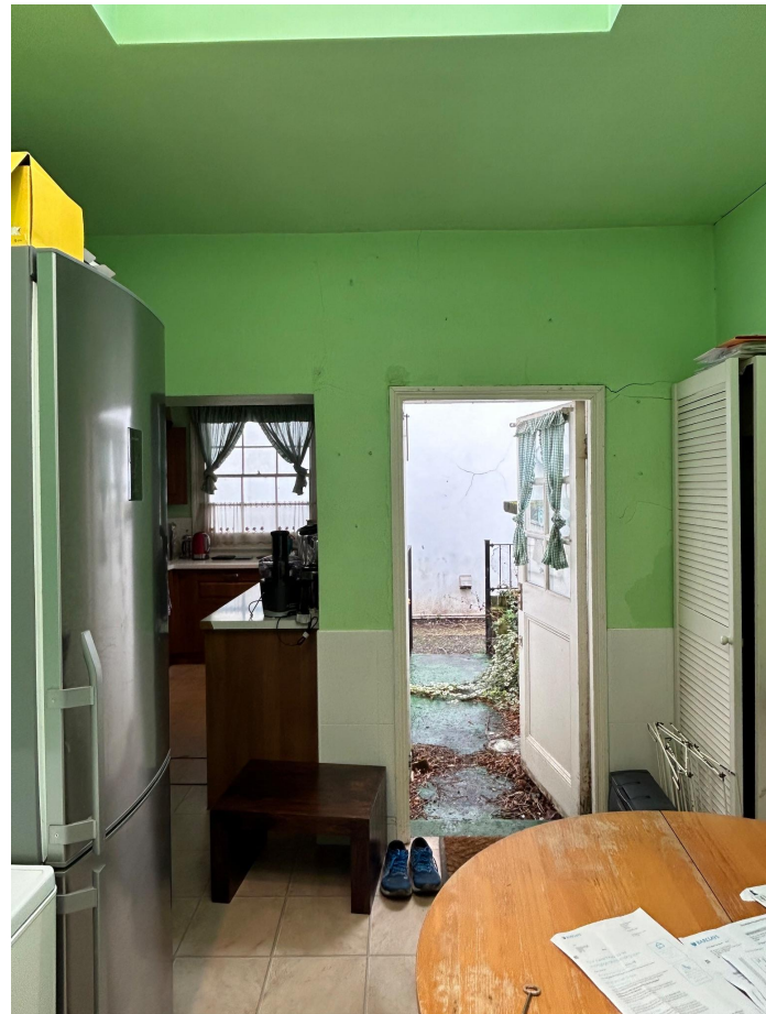
① Condition of kitchen walls and opening