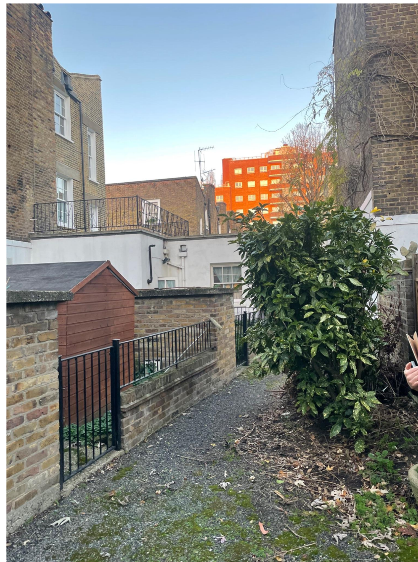
2 View back to 26 Medburn St from the shared garden area