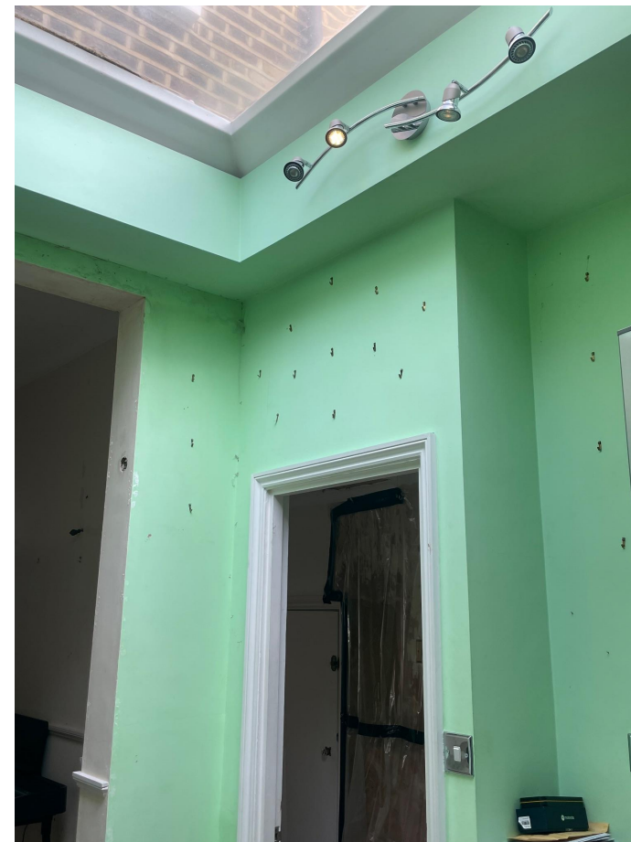
③ Existing interior lighting and walls