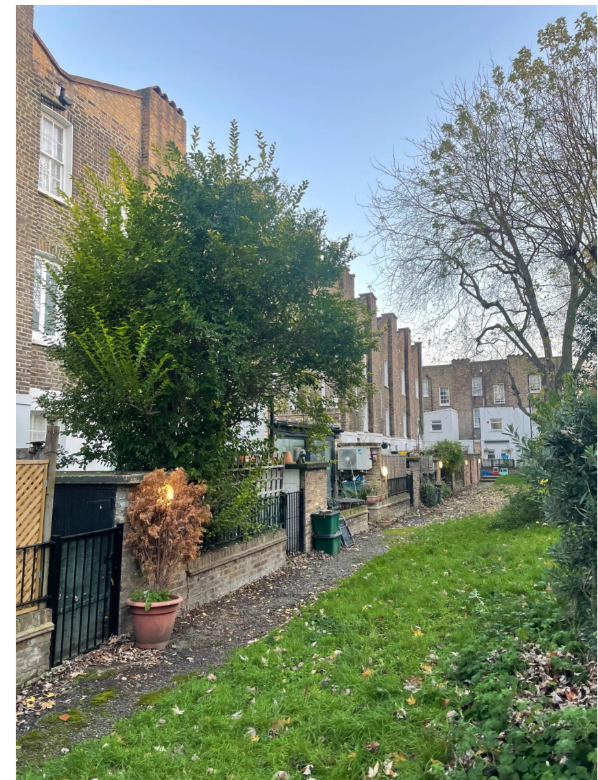
View to properties and their extensions facing onto shared garden