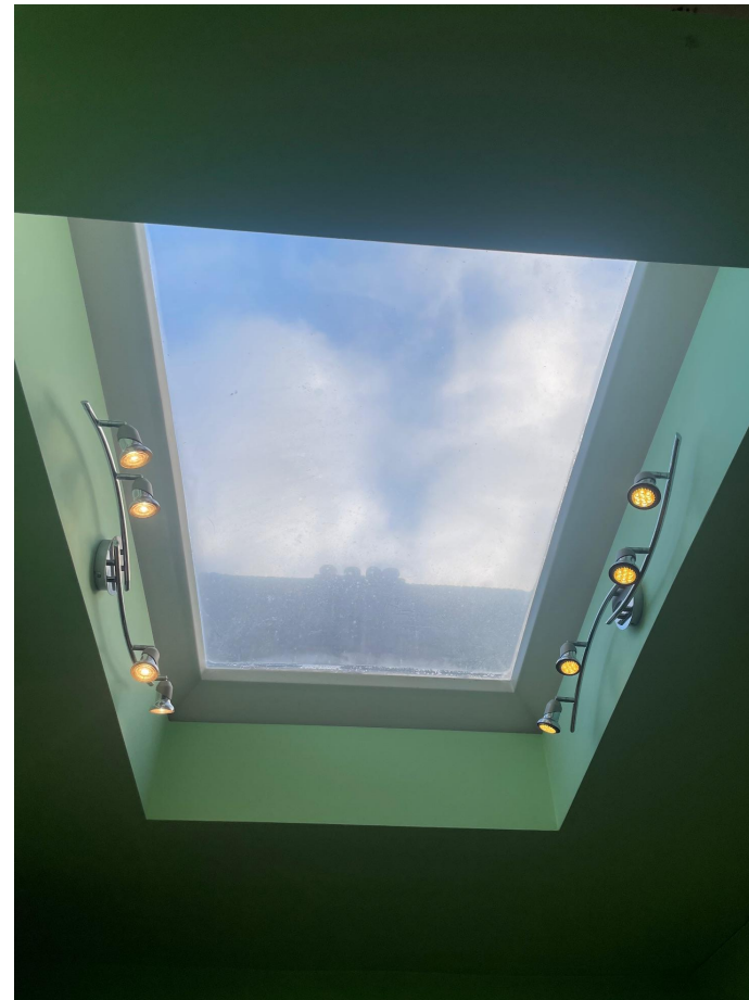
② UPVC rooflight