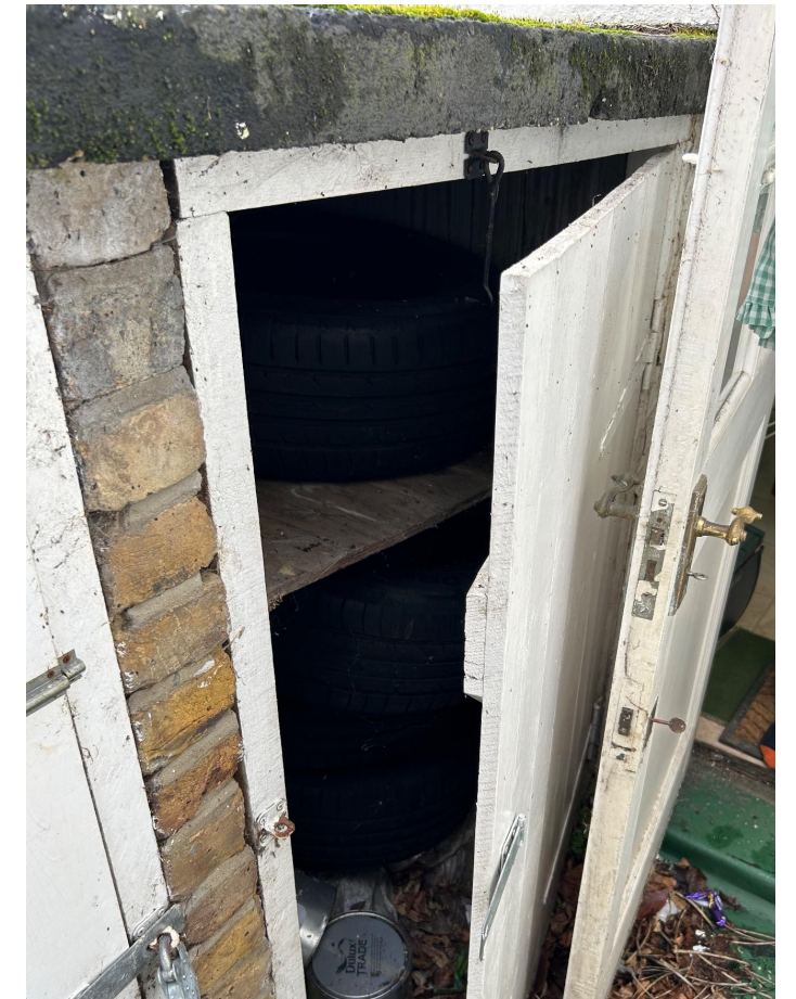
④ Existing exterior storage Note: it's not permitted to be used as a bin store