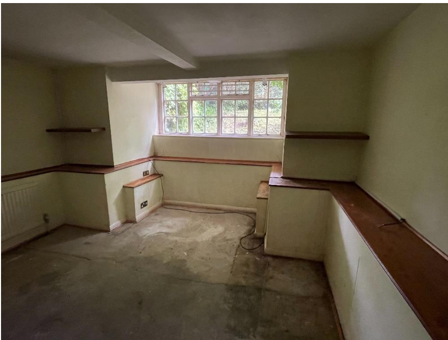
Lower ground floor bedroom