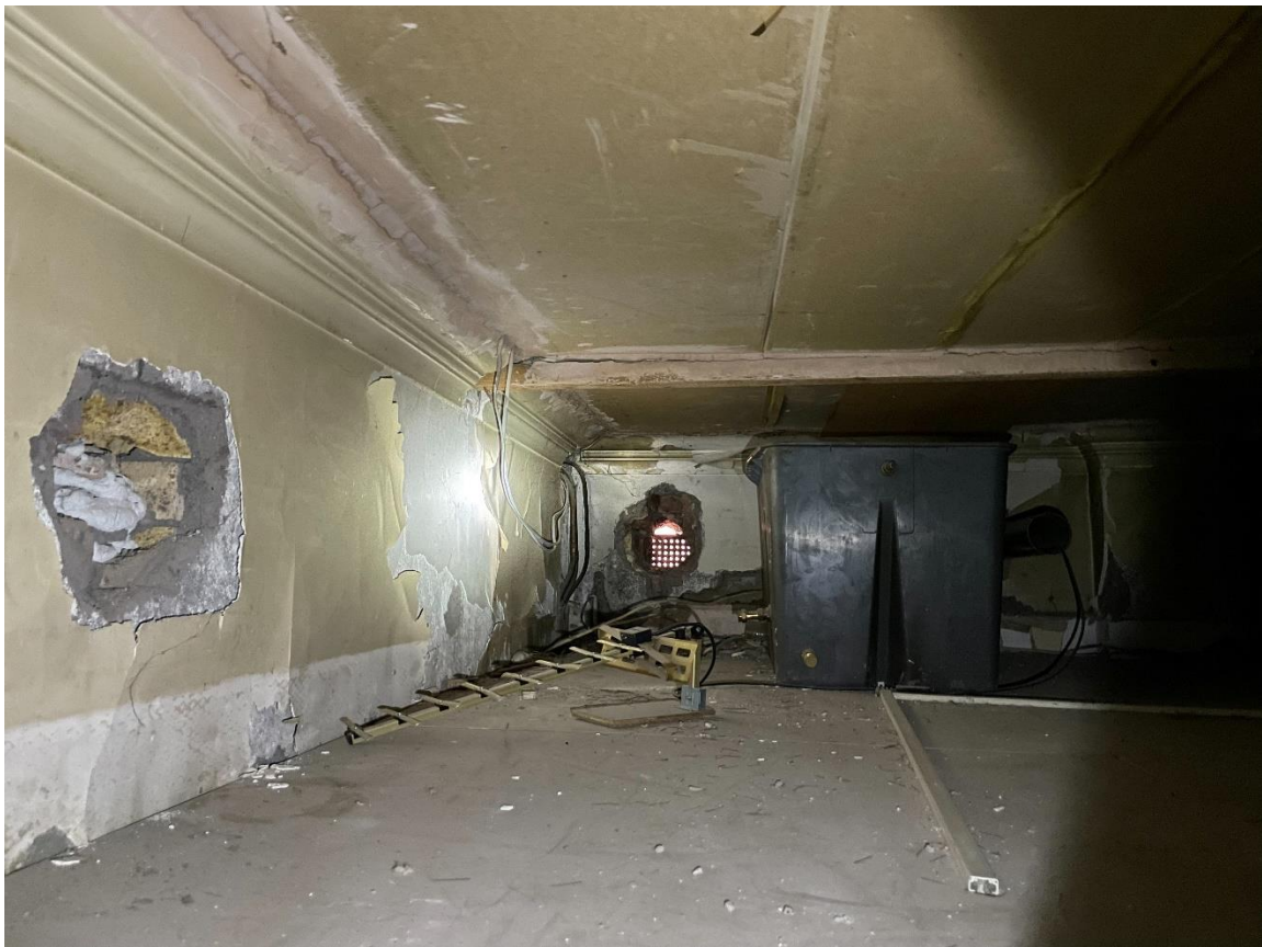
Unit 2 space above lowered ceiling in entrance hall and kitchen