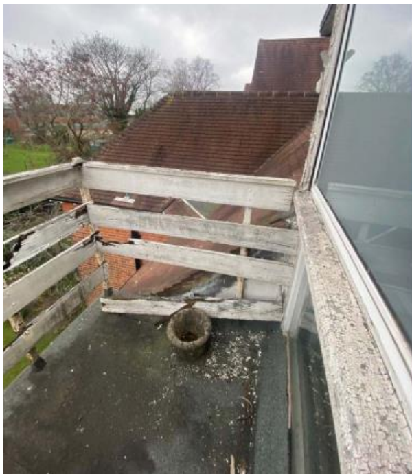
Second floor balcony