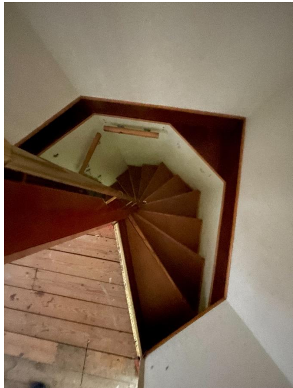
Unit 2 staircase