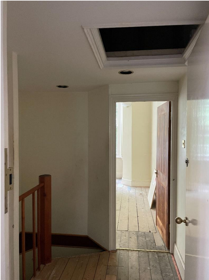
Unit 2 entrance hall with lowered ceiling