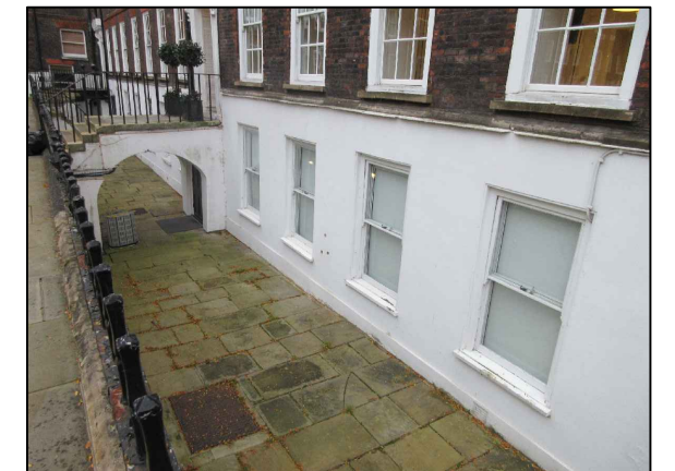
No 8N looking south.