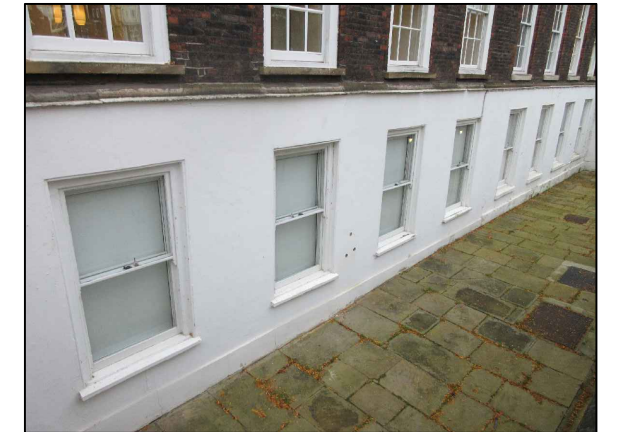
No 8N looking north.