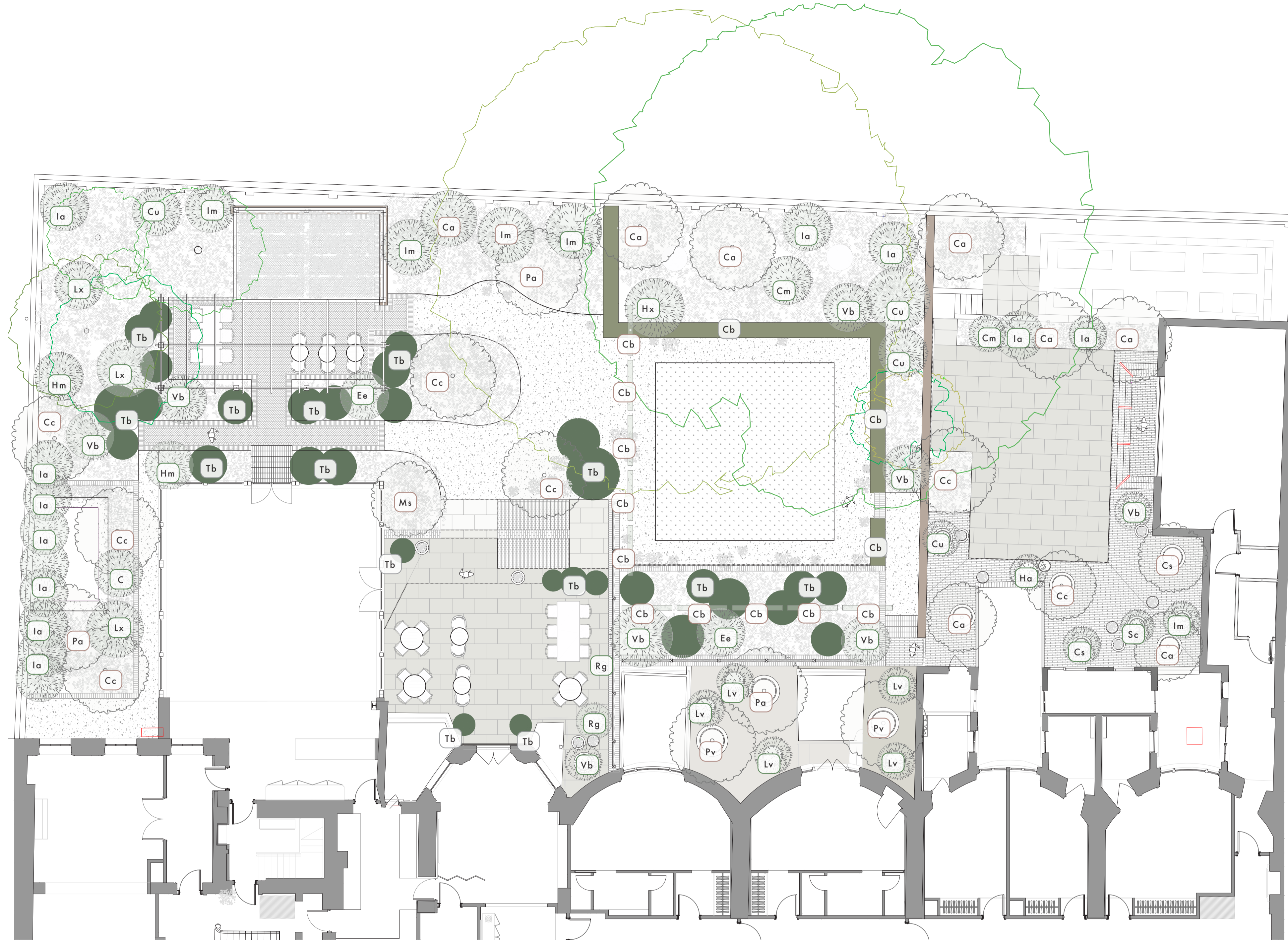
Examples of seasonality