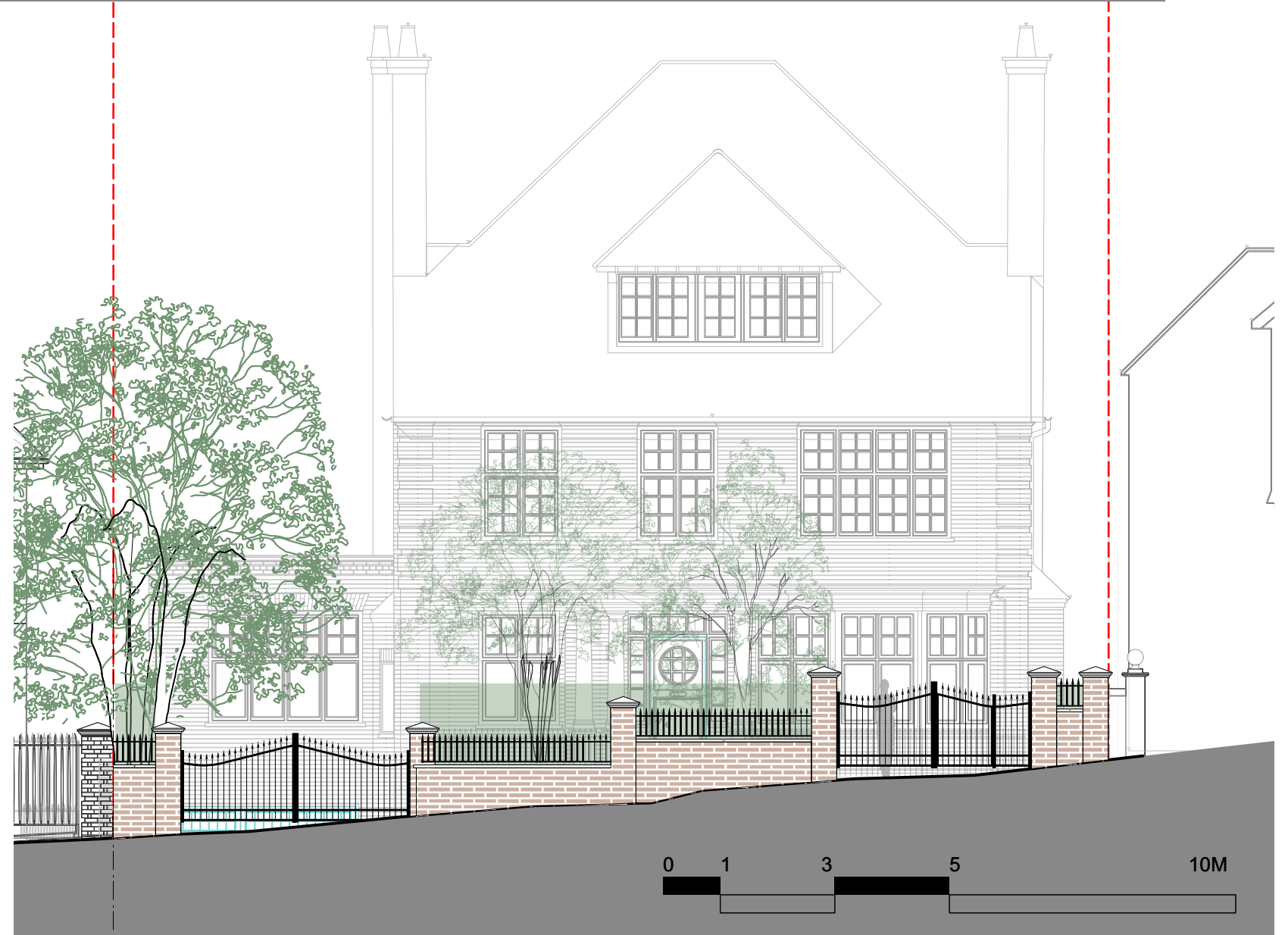
Proposed elevation - front garden 1:100@A3

copyright Charlotte Rowe Garden Design 118 Blythe Road, Brook Green, London, W14 0HD Tel: +44 (0)20 7602 0660 email: design@charlotterowe.com www.charlotterowe.com