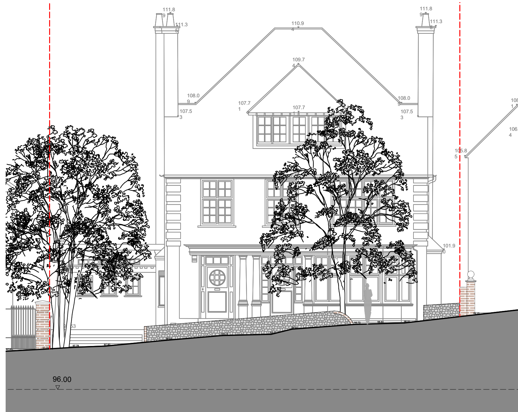
Existing elevation - front garden 1:100@A3