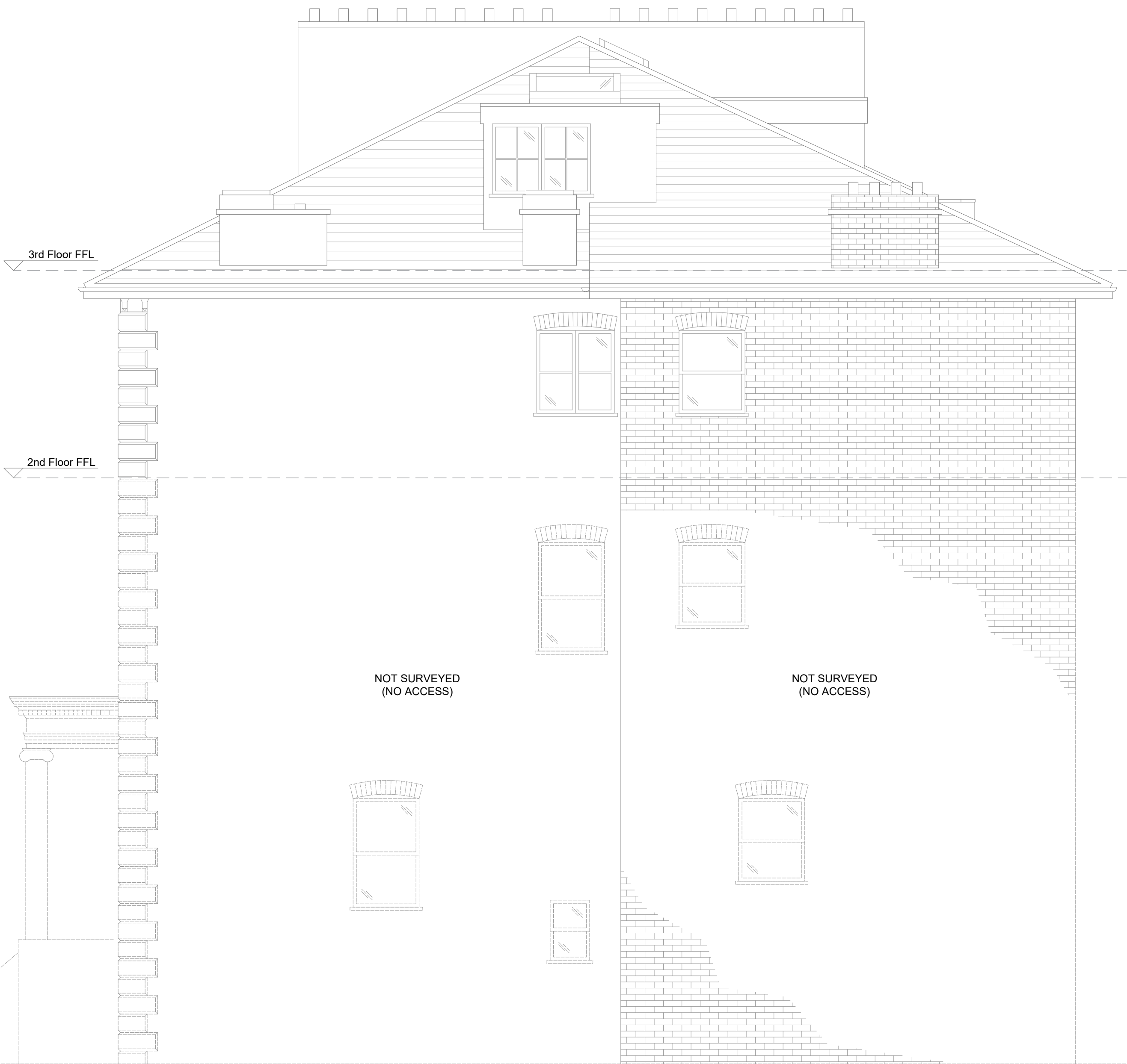
SIDE ELEVATION (1:50)