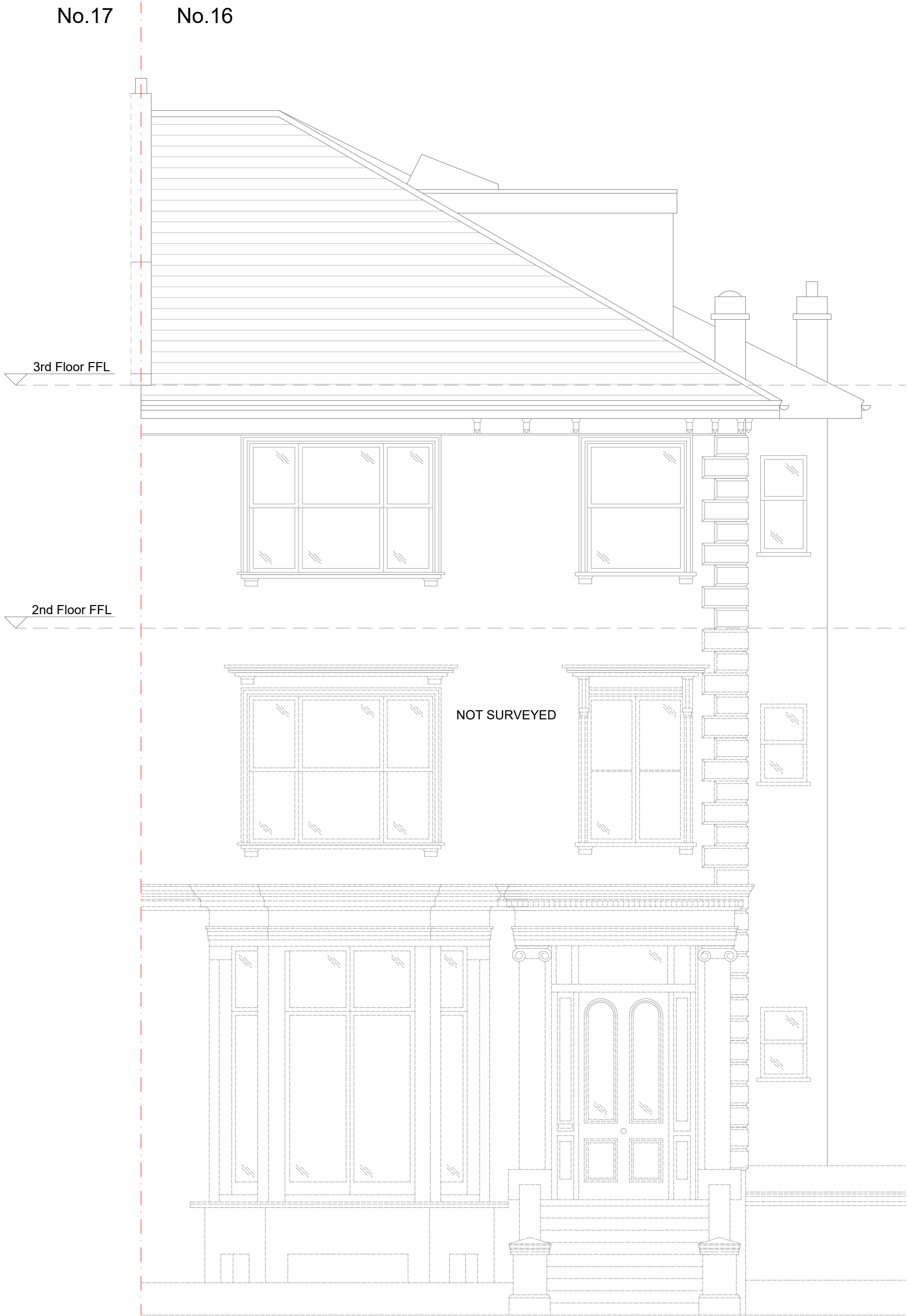
FRONT ELEVATION (1:50)