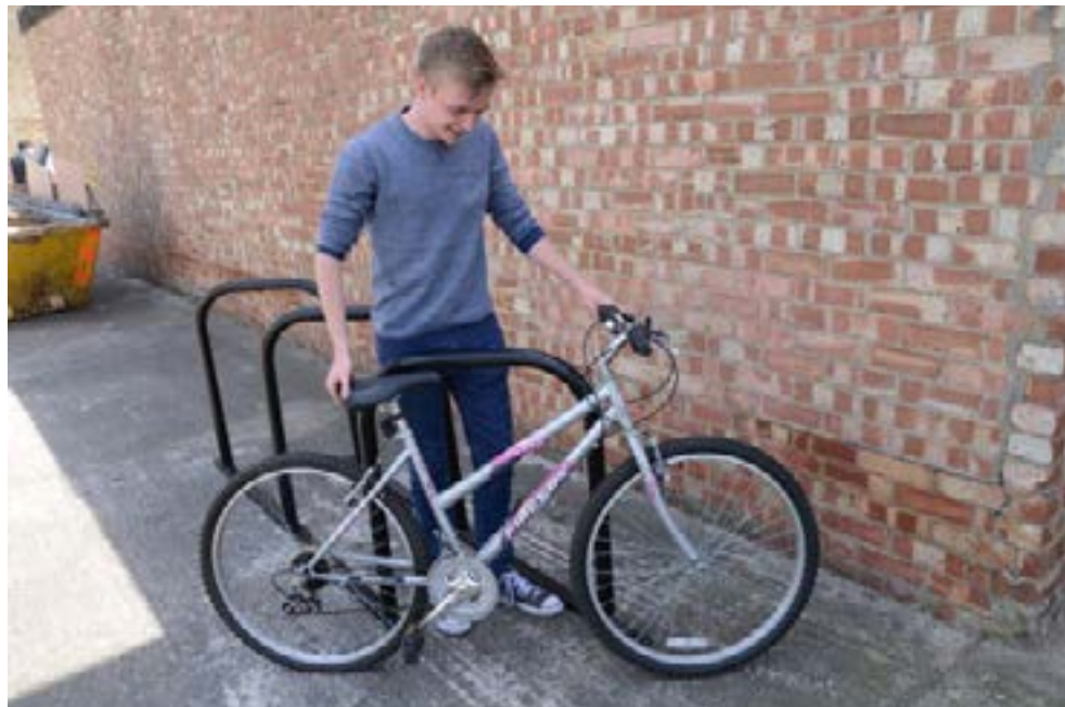
Proposed bike storage method

Two sets of floor mounted 3 bay 45 degree Sheffield stands to maximise the amount of storage and to make best use of the floor plan of the entrance lobby. Six bikes can be accommodated per set.