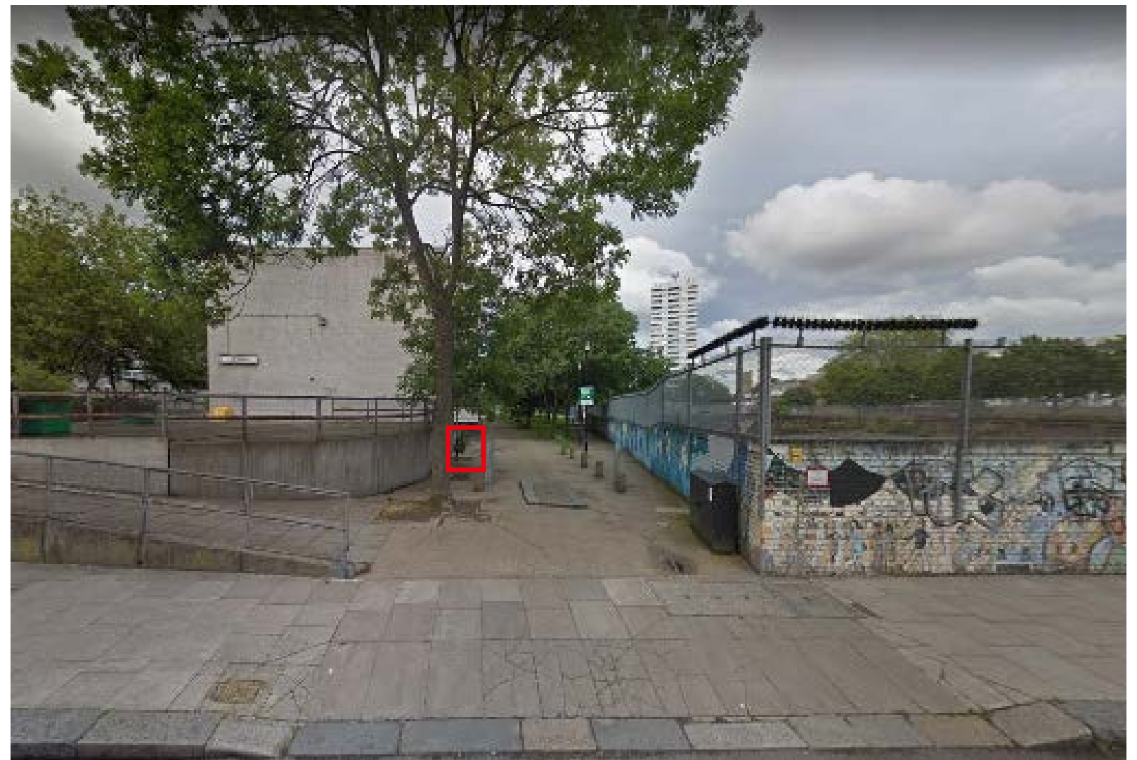
Proposed bin store location outside main entrance of Mosaic School to be used for 2no. new 1100L eurobins which will provide more than double the existing site capacity. Location approved and recommended by Veolia Waste.

Residential bins should be stored in the existing internal bin stores, and not within the Undercroft studio spaces.