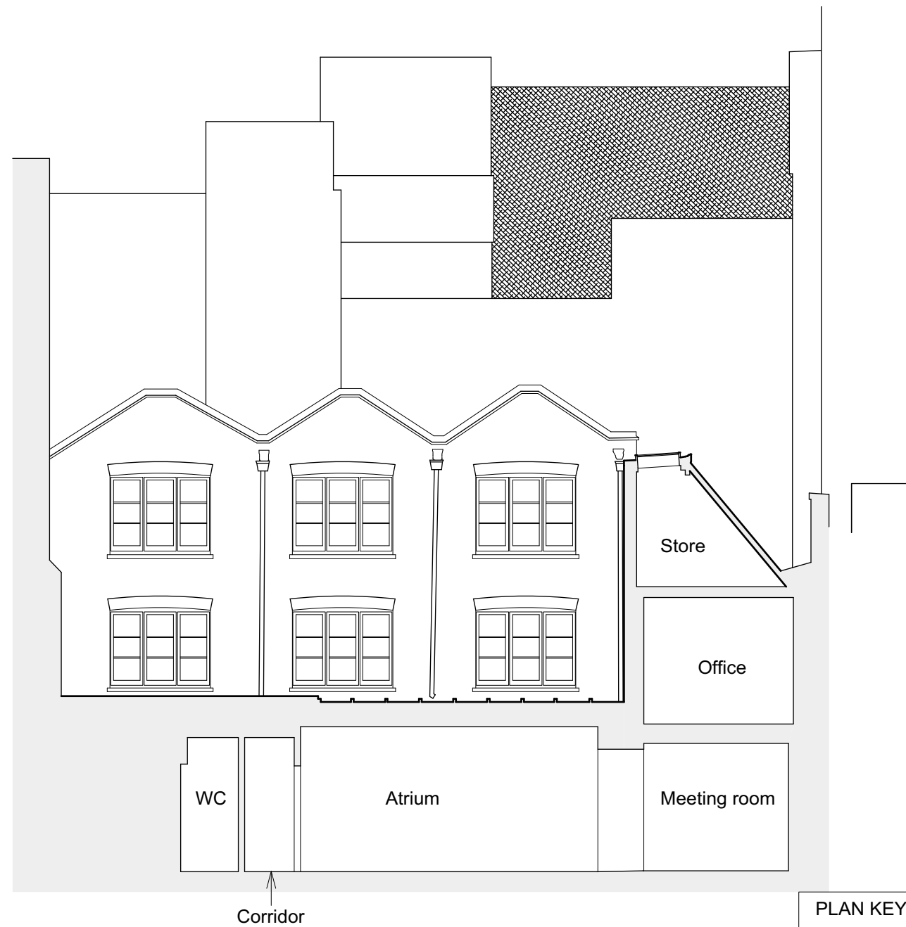
PLAN KEY - ROOF LEVEL