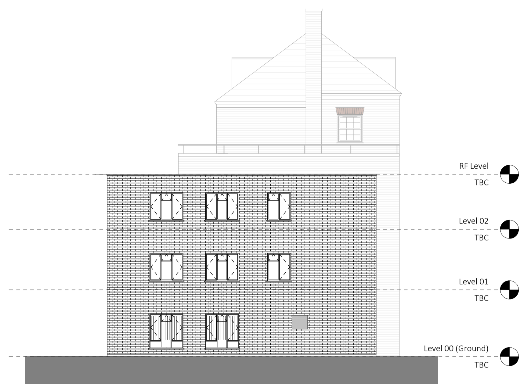
WEST ELEVATION - PROPOSED 1 : 100