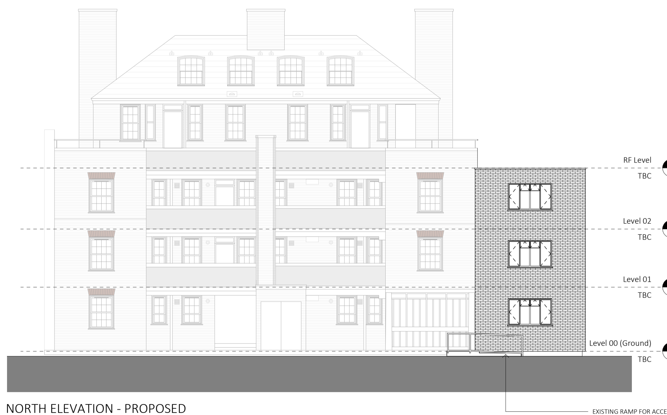
NORTH ELEVATION - PROPOSED 1 : 100