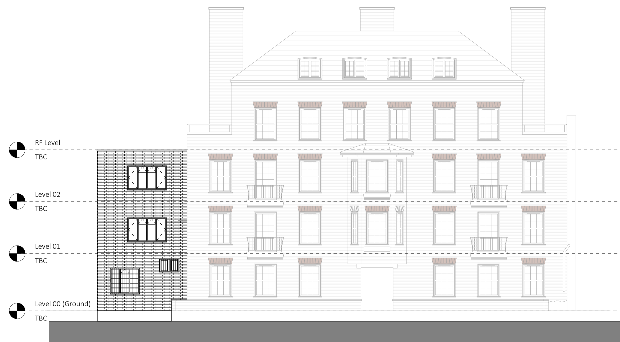
SOUTH ELEVATION - PROPOSED 1 : 100