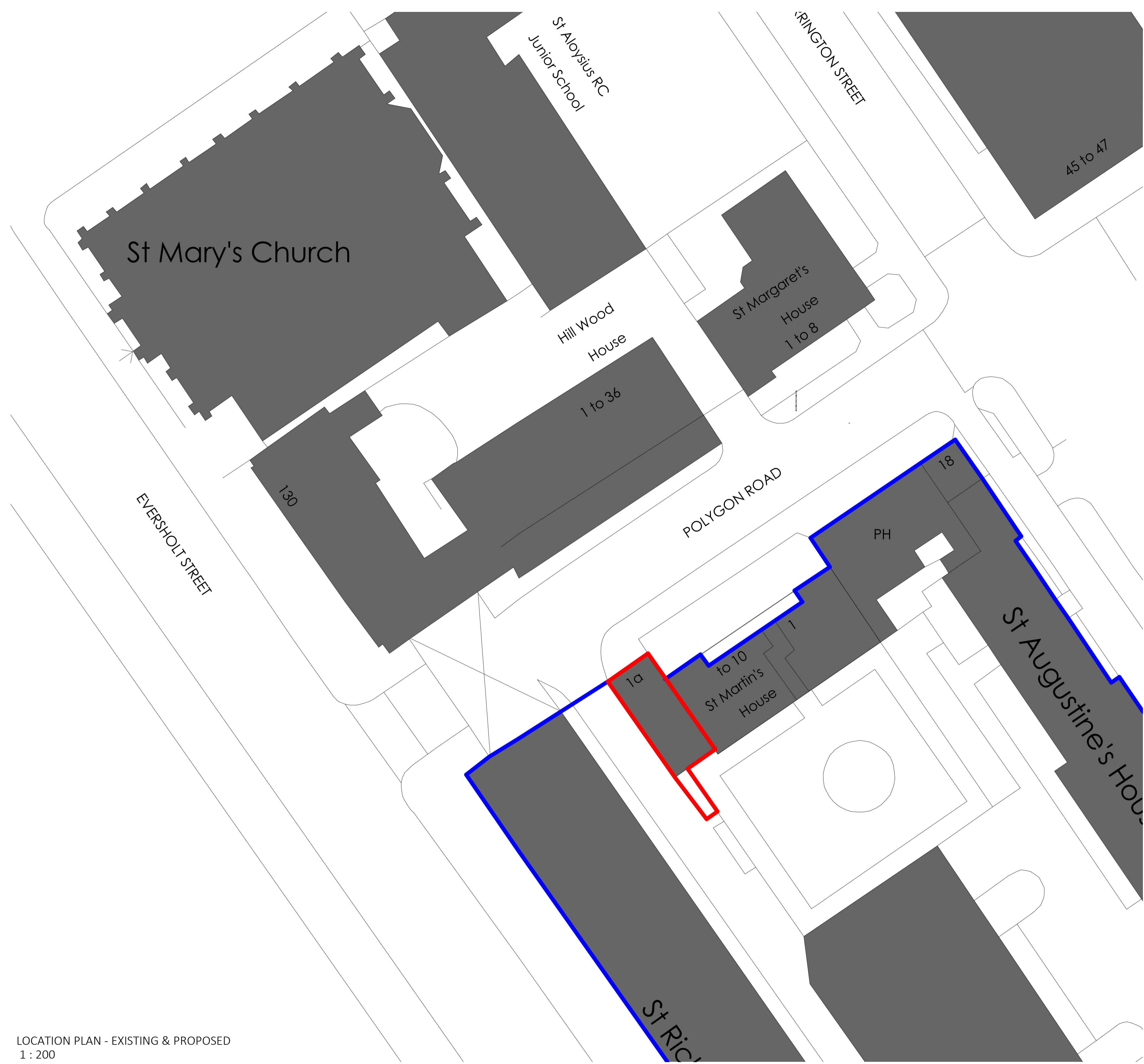
LOCATION PLAN - EXISTING & PROPOSED 1 : 200 SCALE 1:200