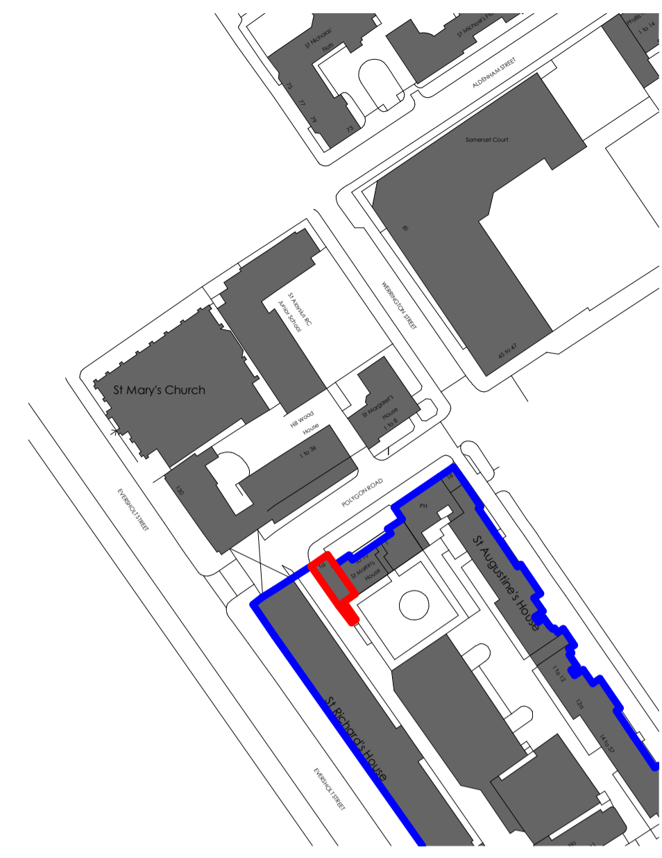
LOCATION PLAN - EXISTING 1 : 1250 SCALE 1:1250