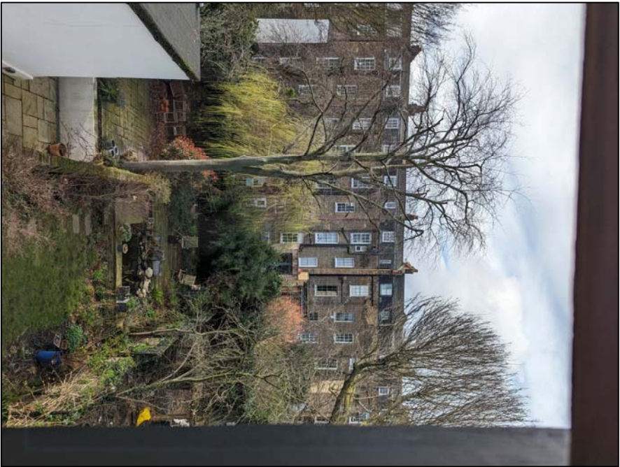
PIC 09. 15 ARLINGTON RD REAR GARDEN