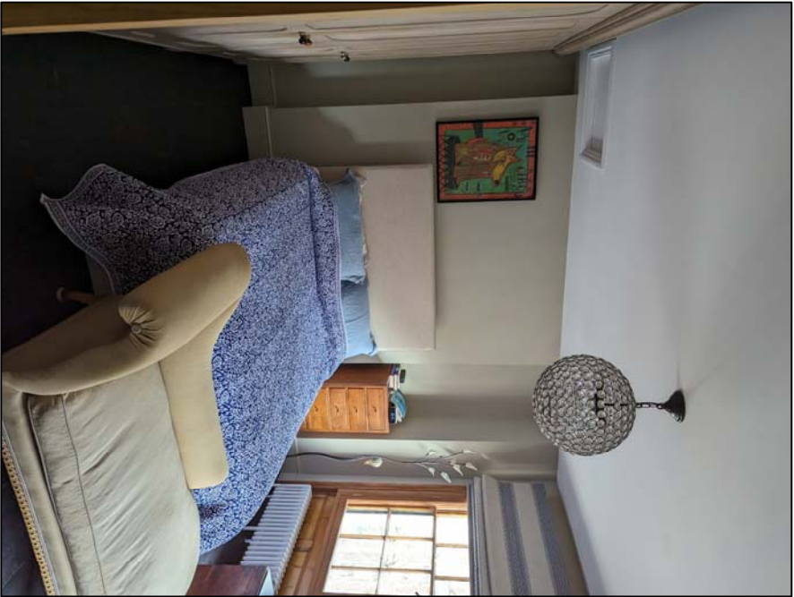
PIC 28. BEDROOM 01