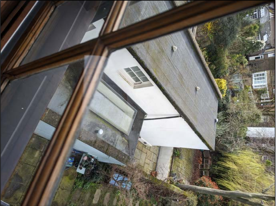
PIC 12. 13 ARLINGTON RD REAR GARDEN