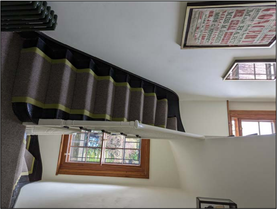
PIC 22. STAIRCASE FIRST FLOOR LANDING