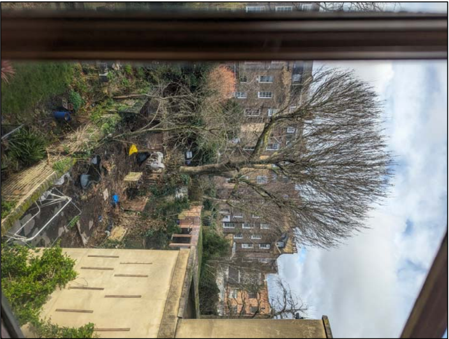
PIC 11. 17 ARLINGTON RD REAR GARDEN