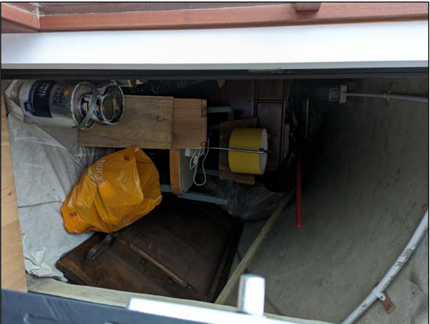
PIC 23. VAULTS