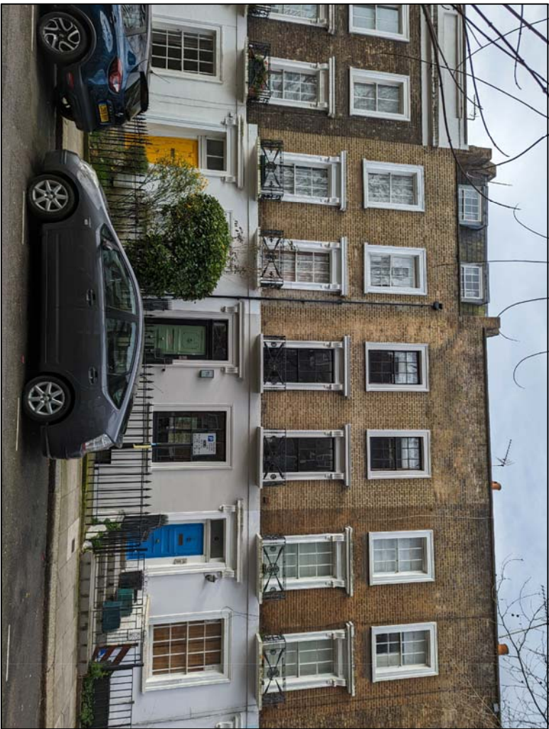
PIC 01. 15 ARLINGTON RD (CENTRE), 13 ARLINGTON RD (LEFT) & 17 ARLINGTON RD (RIGHT)

GENERAL NOTES 1. EXISTING SCALE DRAWINGS, DIMENSION CONCERN. 2. ALL DIMENSIONS ARE IN MILLIMETERS UNLESS NOTED OTHERWISE. 3. ALL DIMENSIONS SHALL BE CHECKED ON SITE BEFORE PROCEEDING WITH THE WORK. 4. ANY DISCREPANCIES SHALL BE REPORTED TO THE ARCHITECT IMMEDIATELY. 5. ANY AREAS INDICATED ON THIS SHEET ARE APPROXIMATE AND INDICATIVE ONLY. 6. INFORMATION IS SUBJECT TO STATUTORY APPROVALS AND RECOMMENDATIONS AND COORDINATION WITH ALL RELEVANT CONSULTANTS