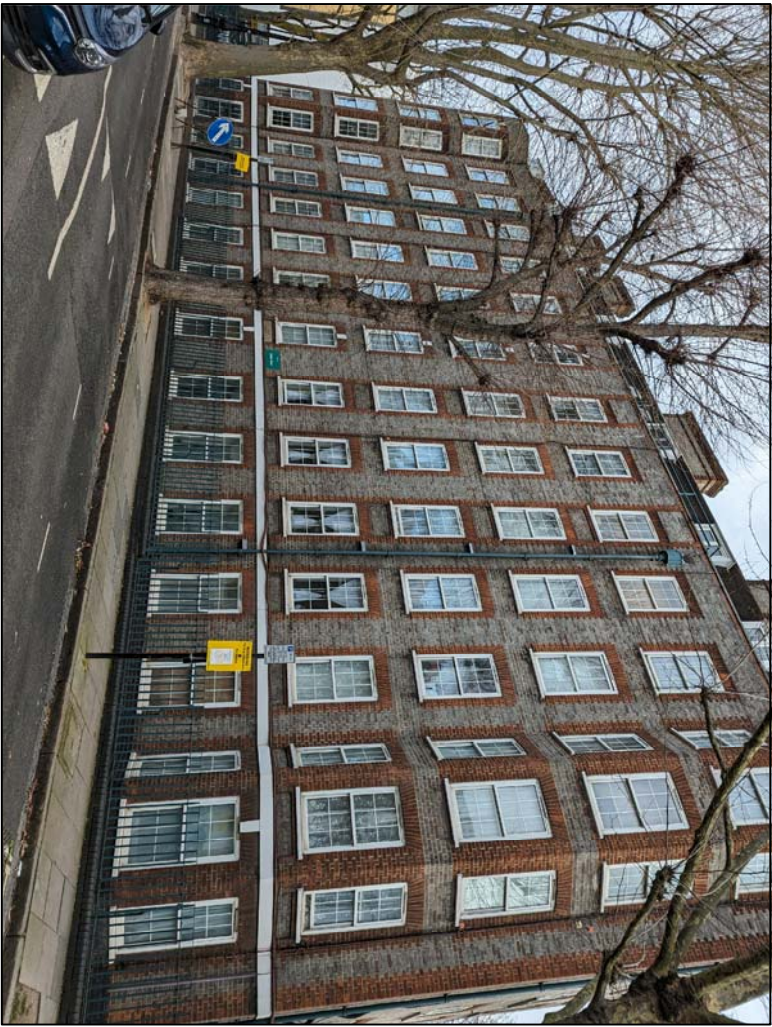
PIC 02. COBDEN HOUSE (OPPOSITE 15 ARLINGTON RD)