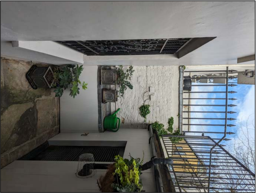
PIC 24. FRONT LIGHT WELL