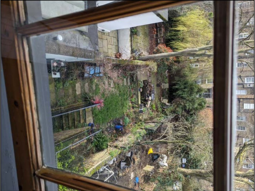
PIC 10. 15 ARLINGTON RD REAR GARDEN