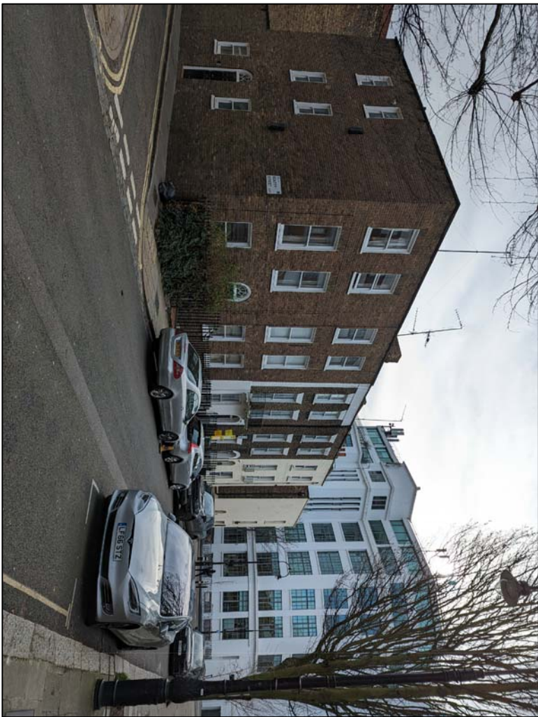
PIC 03. NEIGHBORHOOD EAST SIDE OF ARLINGTON RD