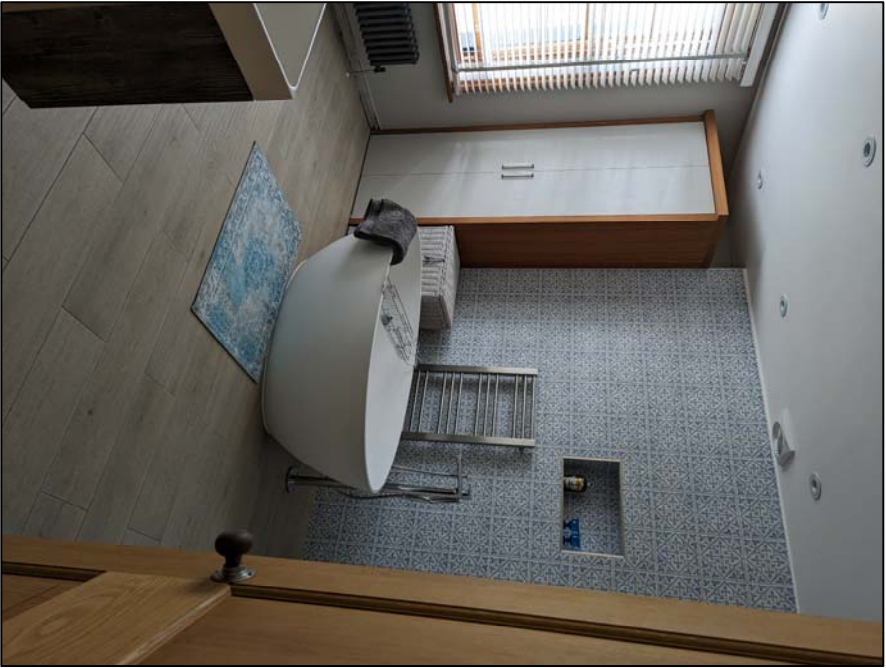
PIC 27. BATHROOM 01