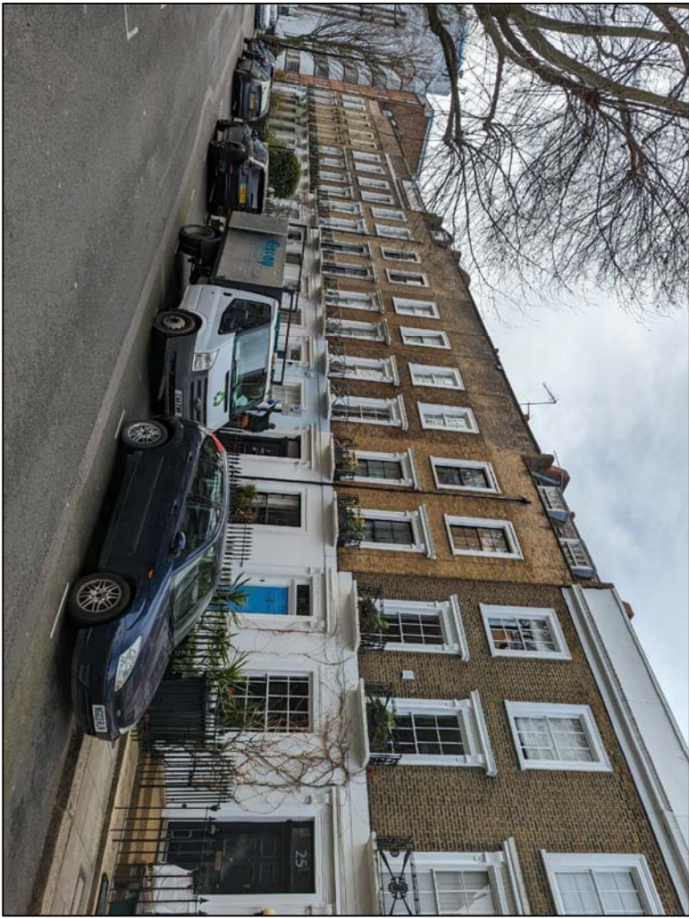
PIC 04. NEIGHBORHOOD WEST SIDE OF ARLINGTON RD