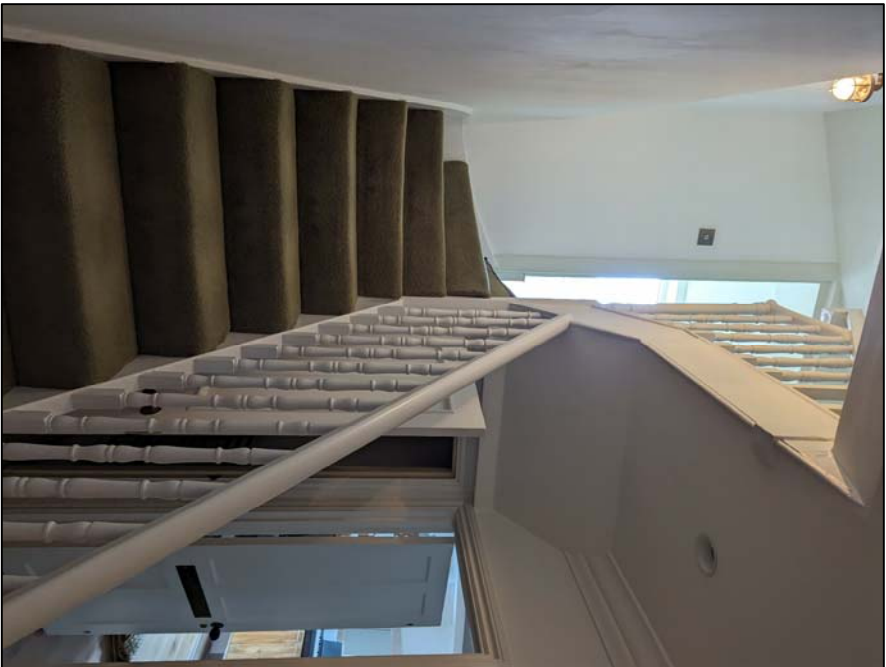
PIC 21. STAIRCASE LOWER TO UPPER GROUND