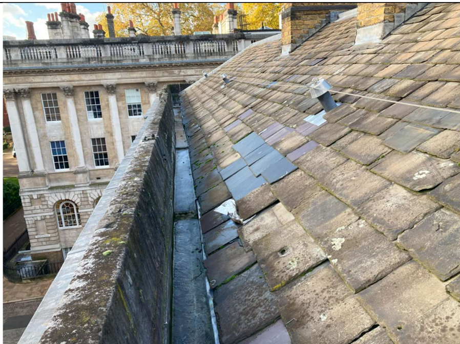
Plate 4 – Delaminated and broken slates to elevation E1