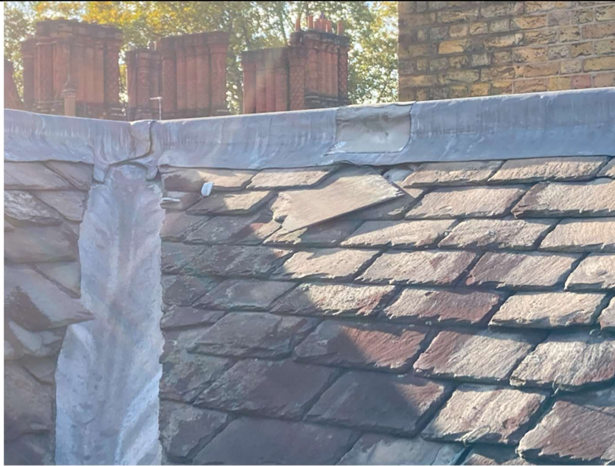
Plate 3 – Ridge tile broken and delaminated slates to E2A, nearest E1