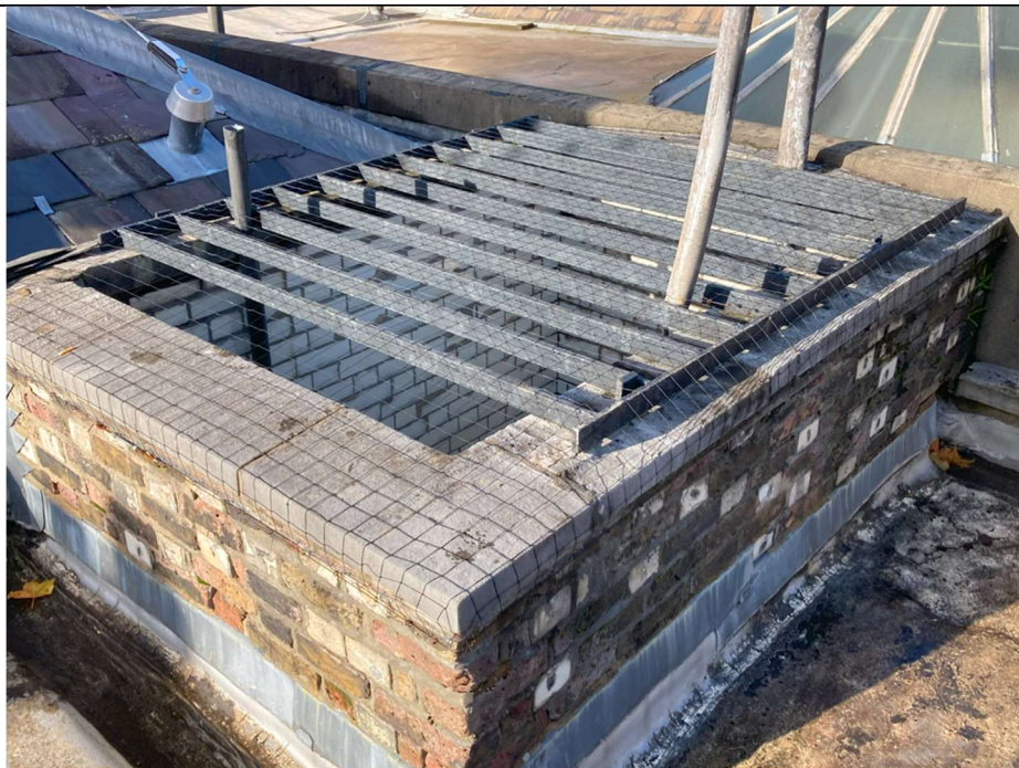
Plate 11 – Pigeon netting over smaller lightwell nearest Chancery lane elevation (E2A).