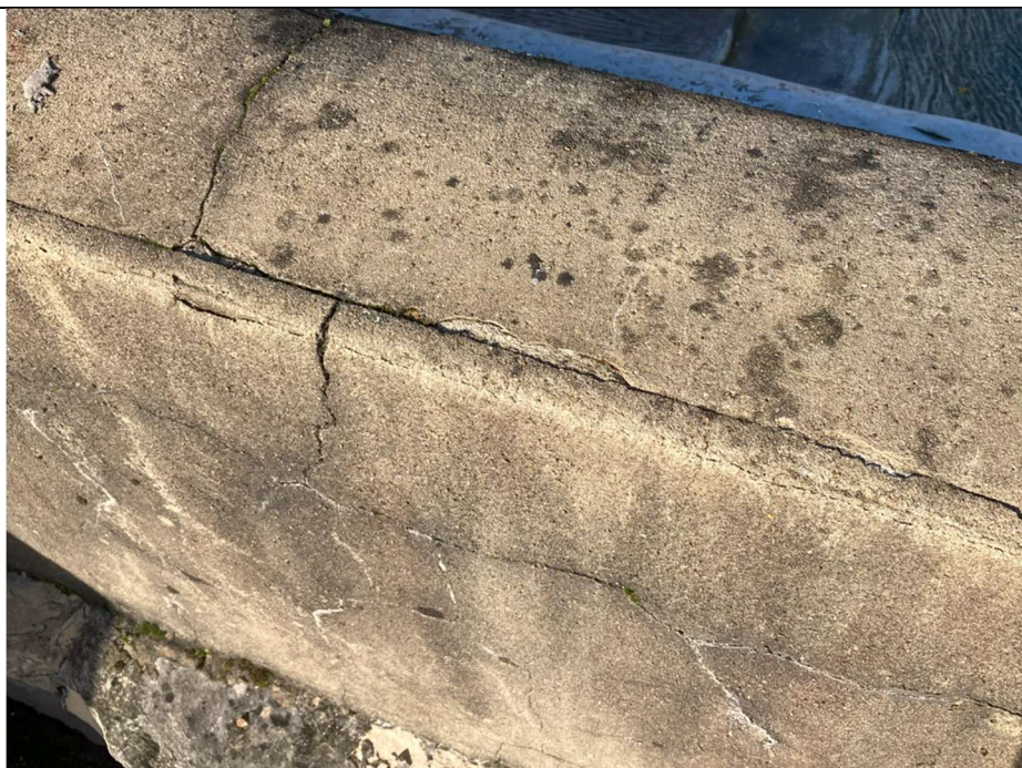
Plate 12 – Cracked render surrounding the base of the parapet wall to the lightwell nearest to Chancery lane elevation.