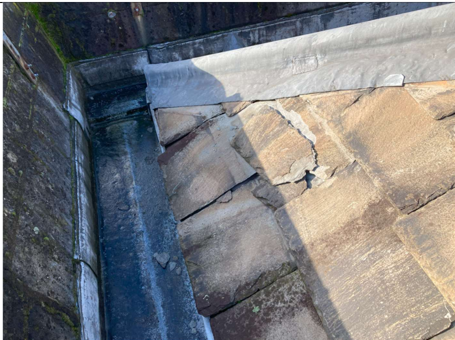
Plate 6 – Detail of delaminated / broken slates to Elevation E1 on junction with E3A.