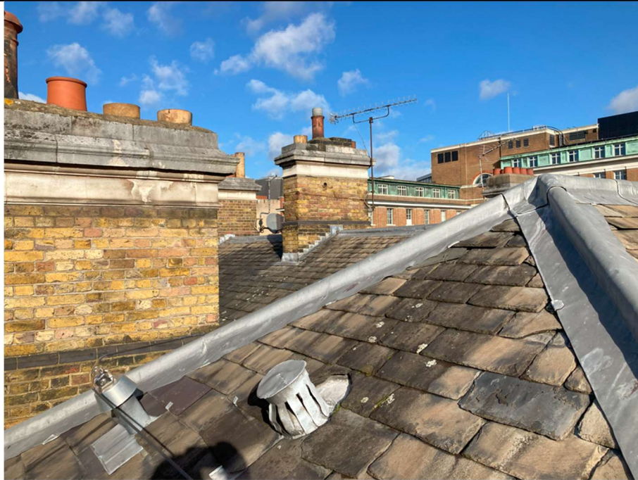
Plate 7 – Detail of delaminated / broken slates to Elevation E3A on junction with E1