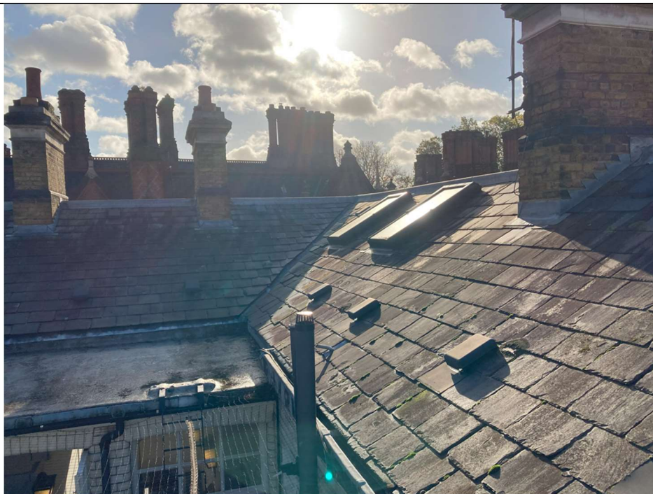
Plate 15 – Inner section of slate-covered roof area surrounding the lightwell nearest to junction of elevations E1 and E3A.