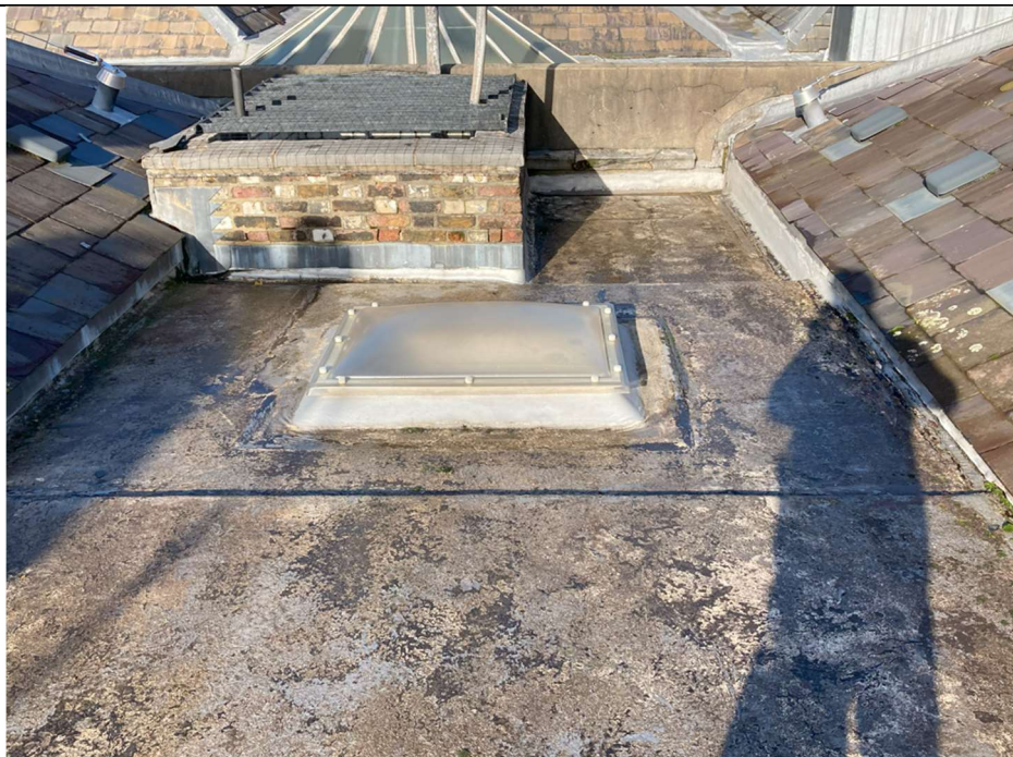
Plate 13 – Asphalt roof area to the central section of the roof area nearest to 10 Stone Buildings.