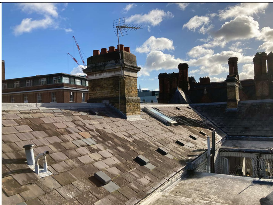
Plate 16 – Inner slate pitched roof area showing inside section of pitched roof to elevation E2A.