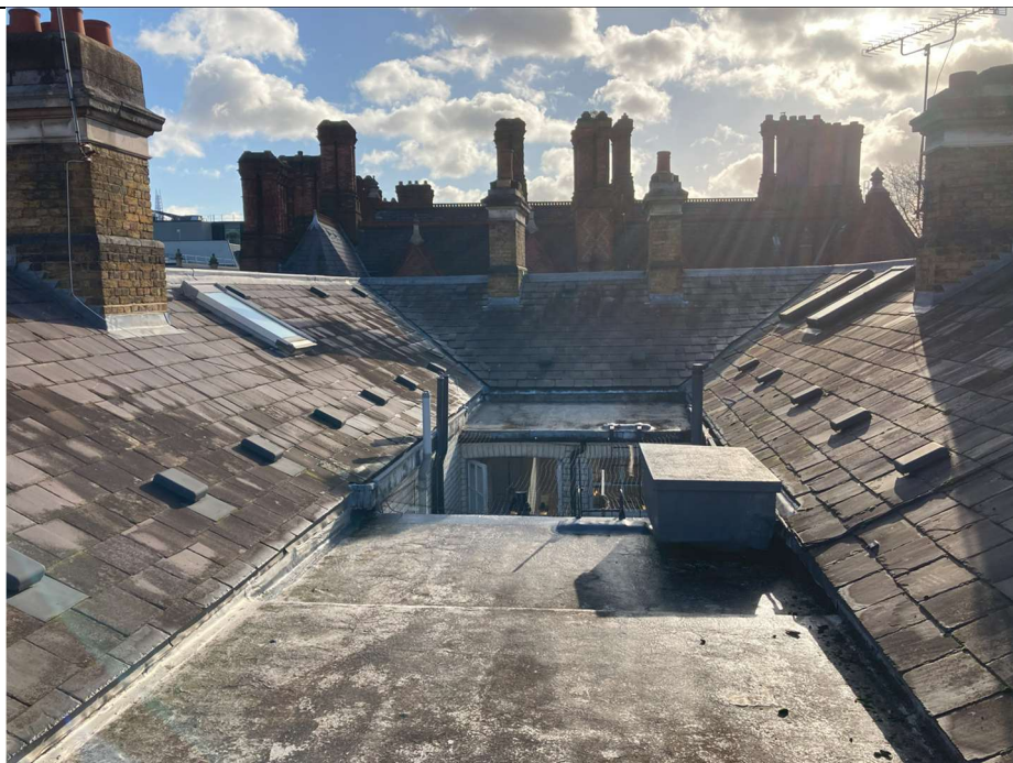
Plate 10 – View of the pigeon netting to lightwell nearest to elevation E3A