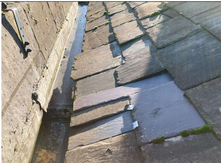
Plate 2 – Detail of slate roof to Elevation E2A