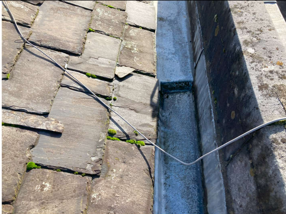
Plate 9 – Further slate damage to elevation E3A.