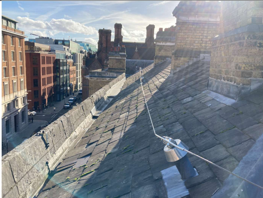
Plate 1 – Roof to Elevation E2A