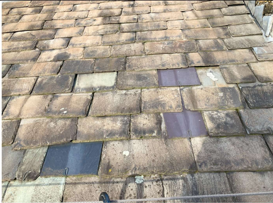
Plate 5 – Detail of delaminated / broken slates to elevation E1