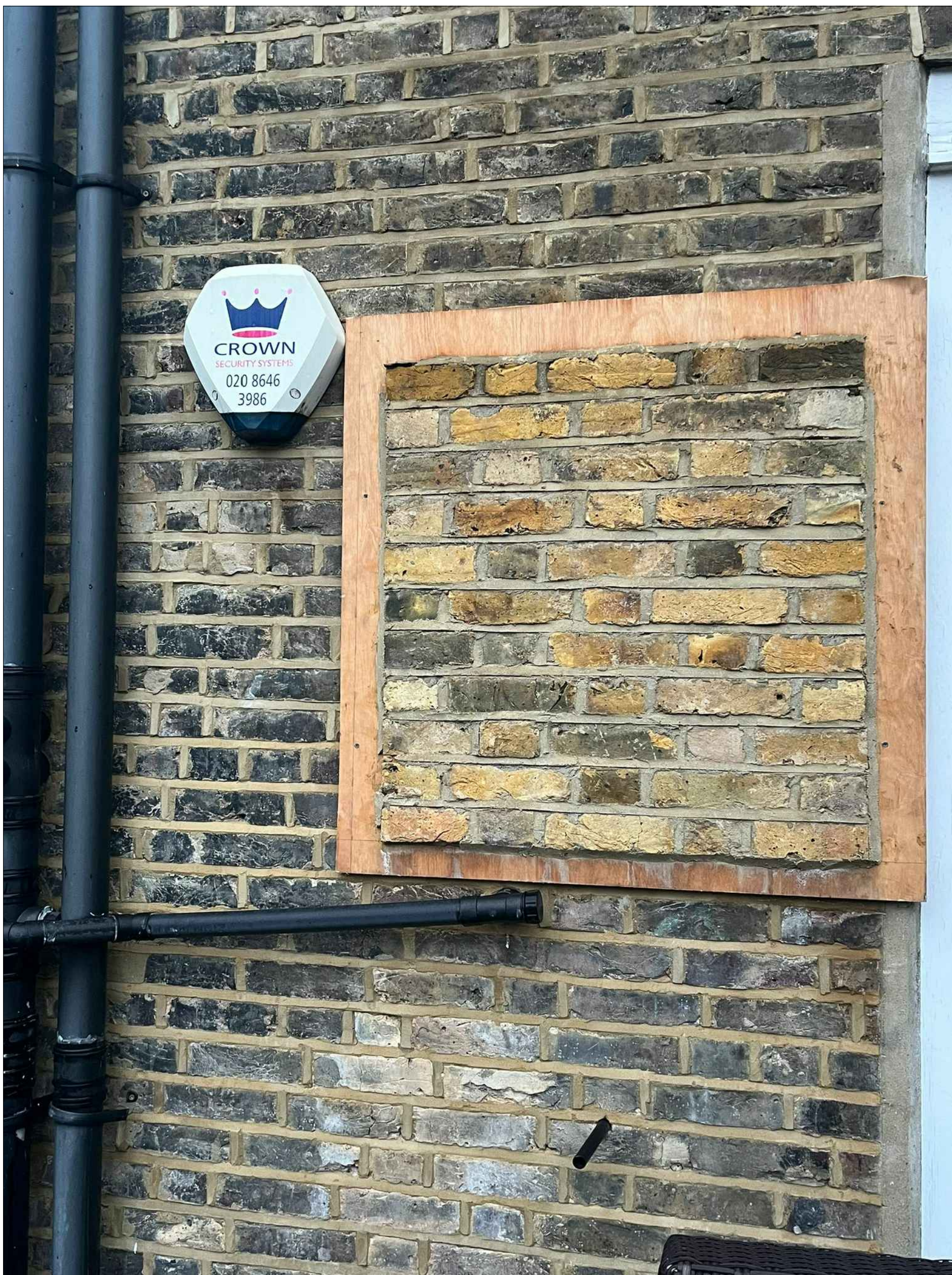
Image 3 Taken on a dull day on 21.02.24 . Rear elevation upper level