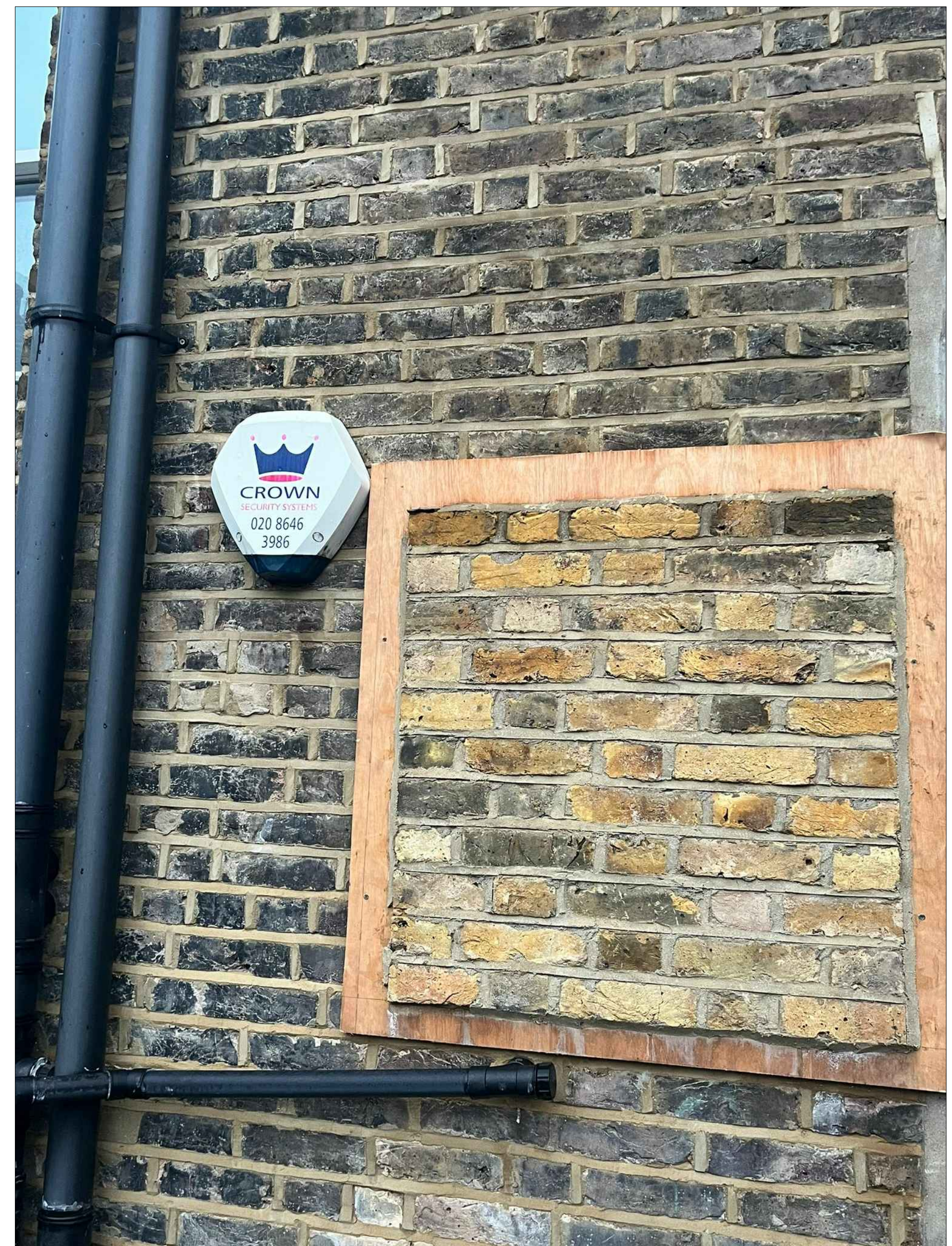
Image 4 Taken on a dull day on 21.02.24 . Rear elevation upper level