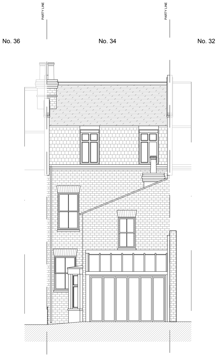
EXISTING REAR FACADE Scale 1:100@A3