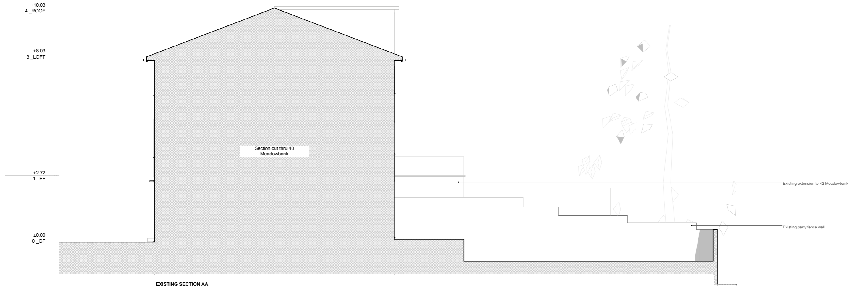
EXISTING SECTION AA