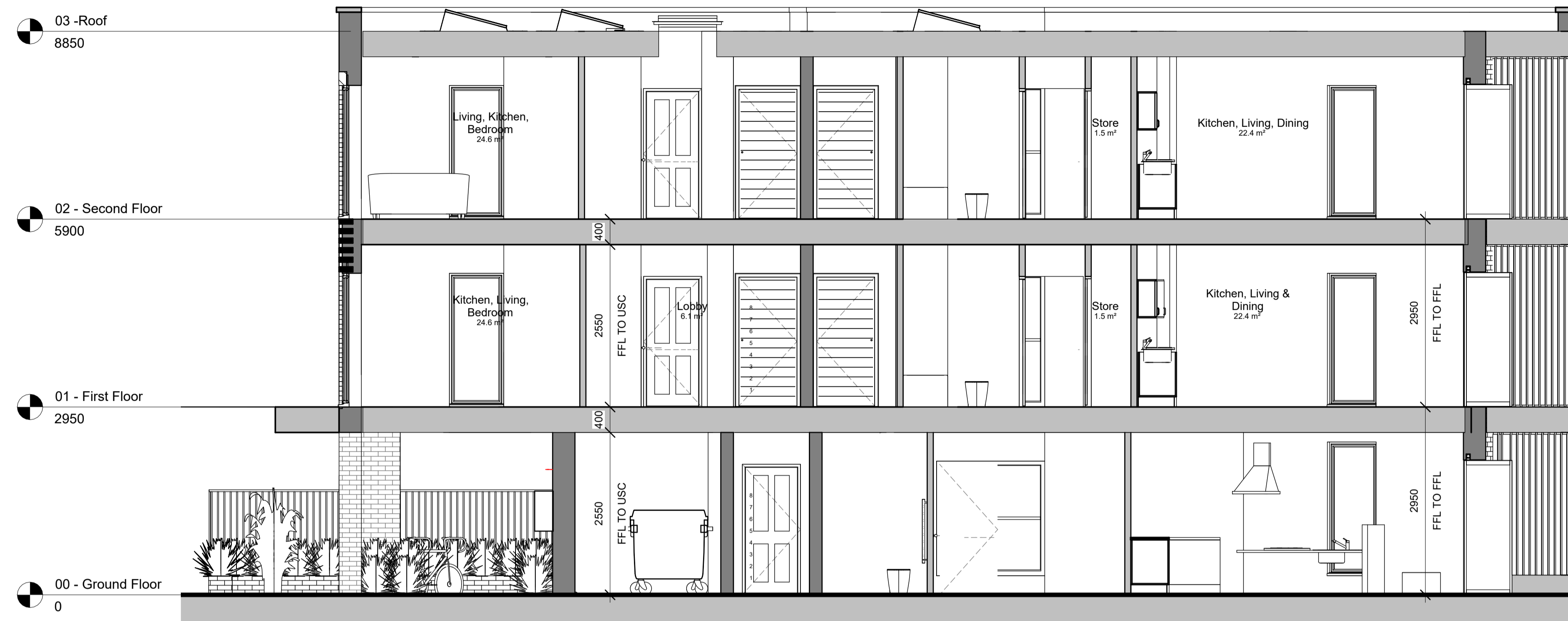
Section A-A 1 : 50