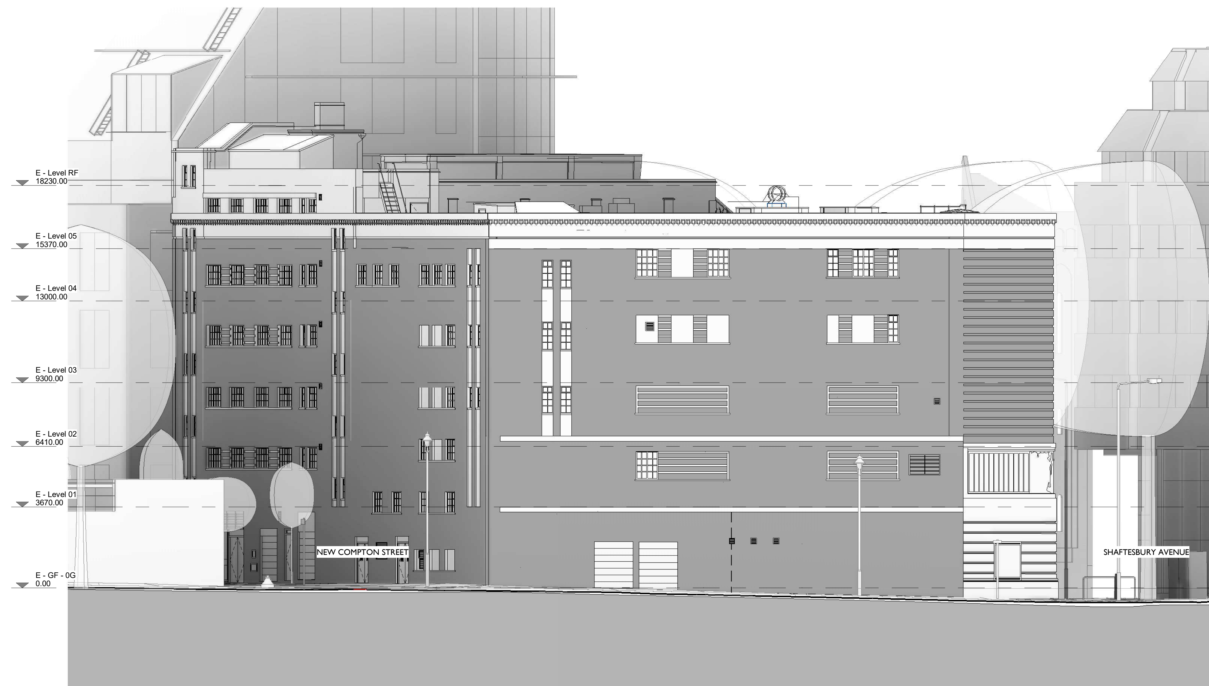
02-3002 - Southwest Elevation 1: 100