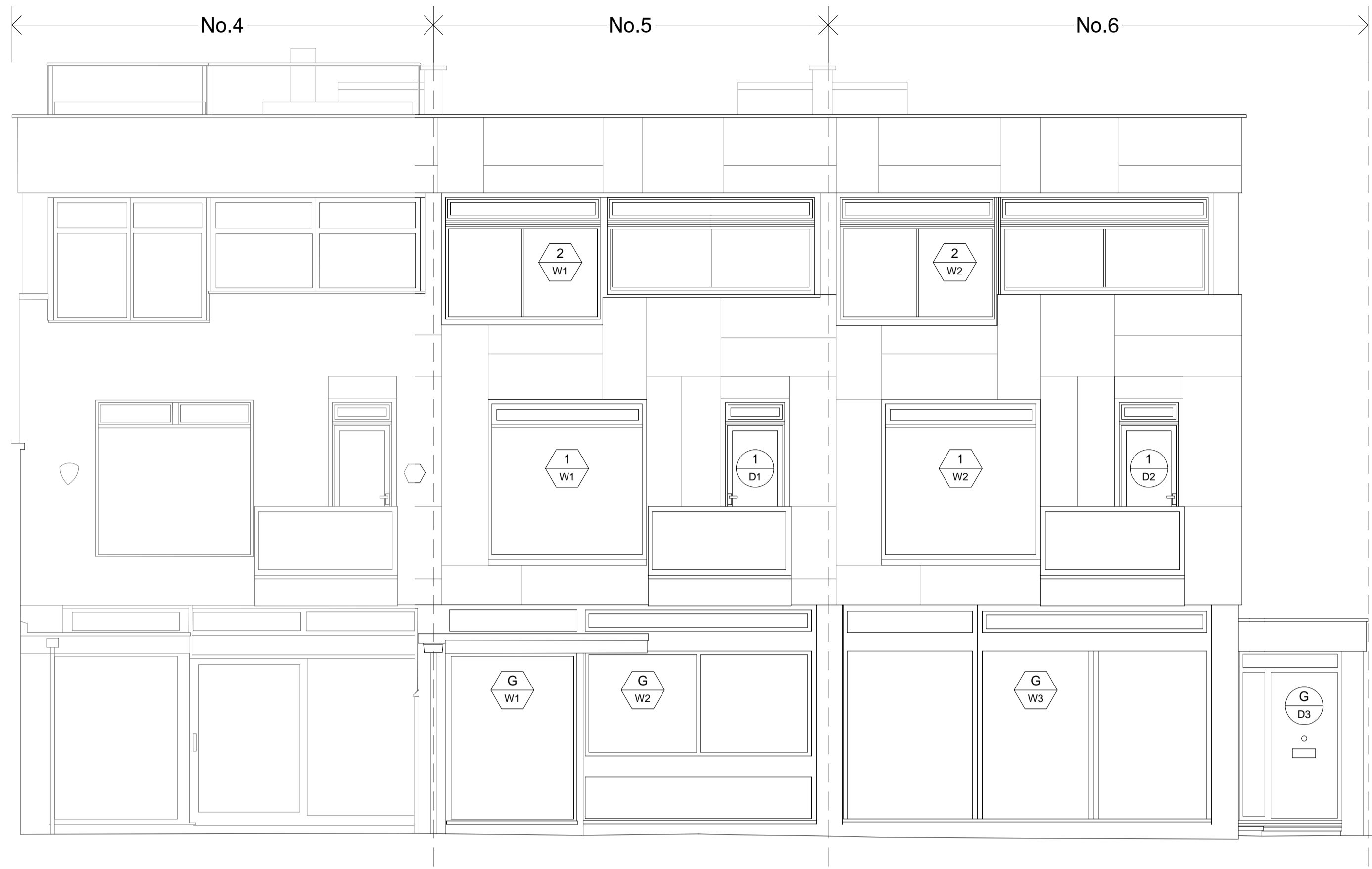
1 EXISTING SOUTH ELEVATION (FRONT) A1 @ Scale: 1:50