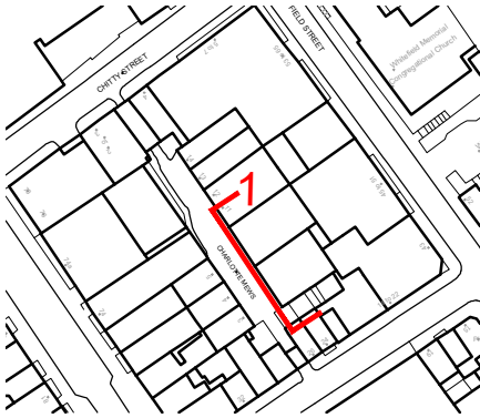
KEY PLAN - NOT TO SCALE

This drawing contains critical information in colour. To ensure this information is legible, only print or copy this drawing in full colour.