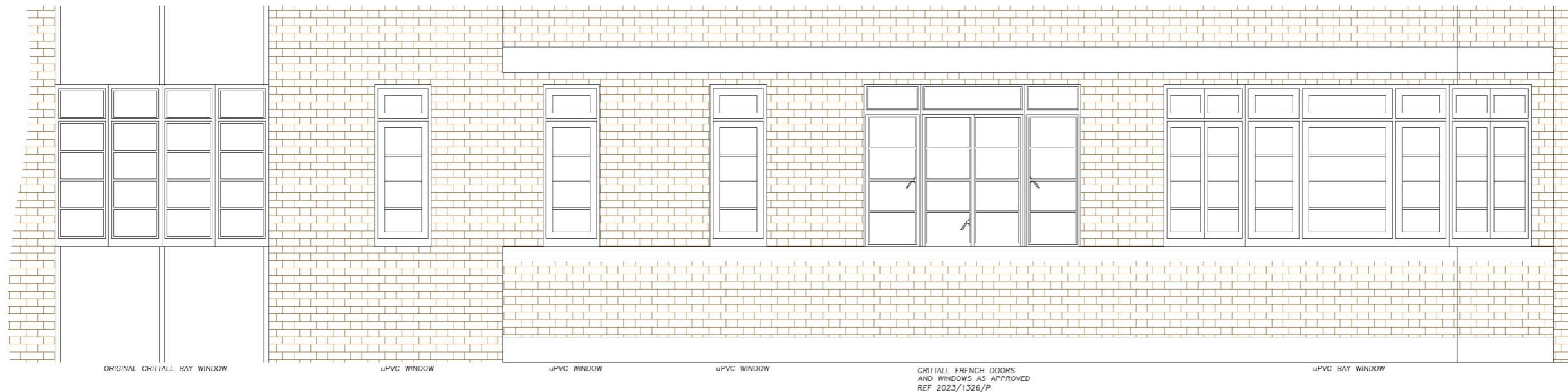
FLAT 63 - EXISTING ELEVATION