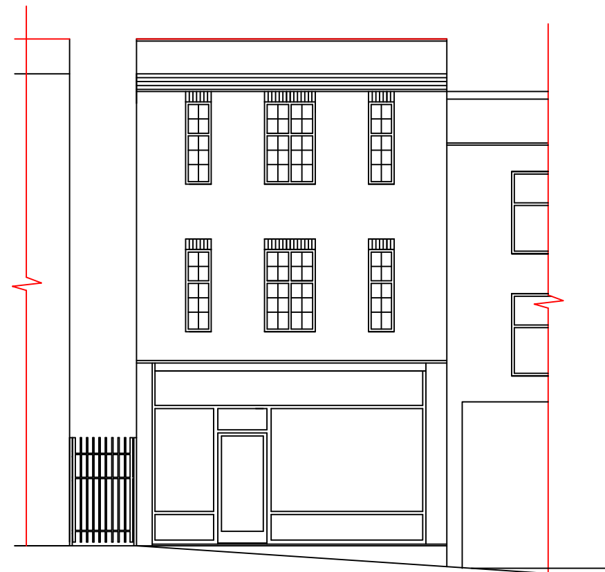
Existing and Proposed Front Elevation