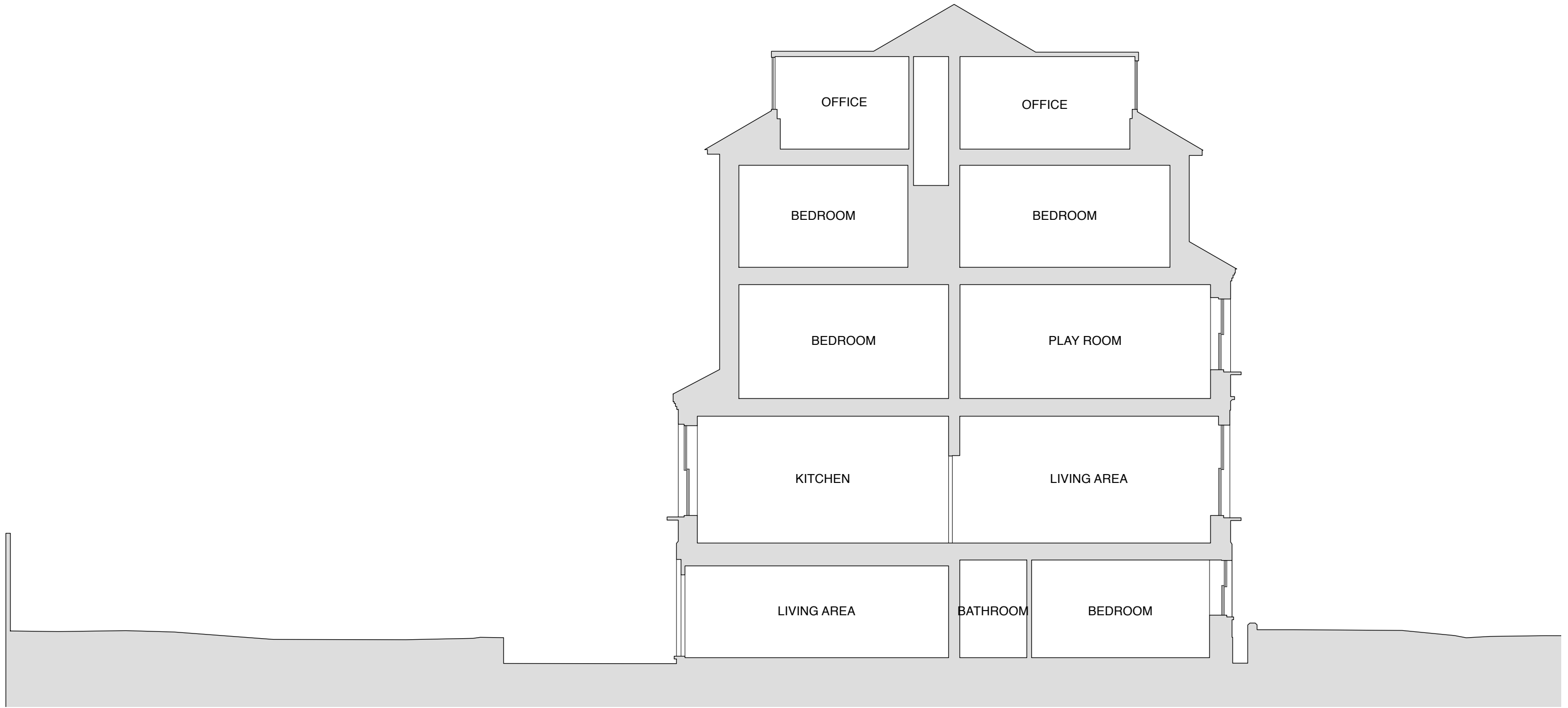
1 Existing Section AA Scale: 1:100