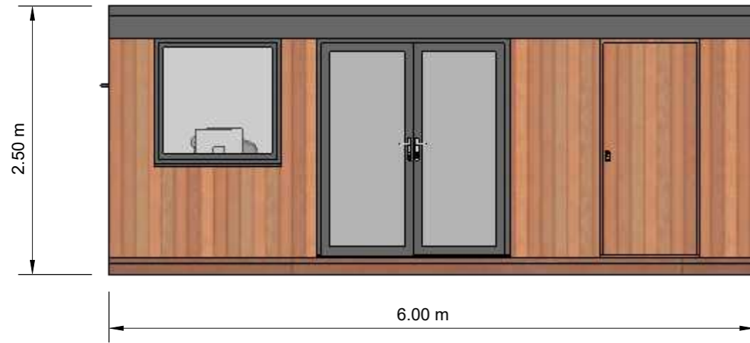
PROPOSED FRONT South West