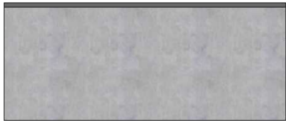
PROPOSED REAR North East