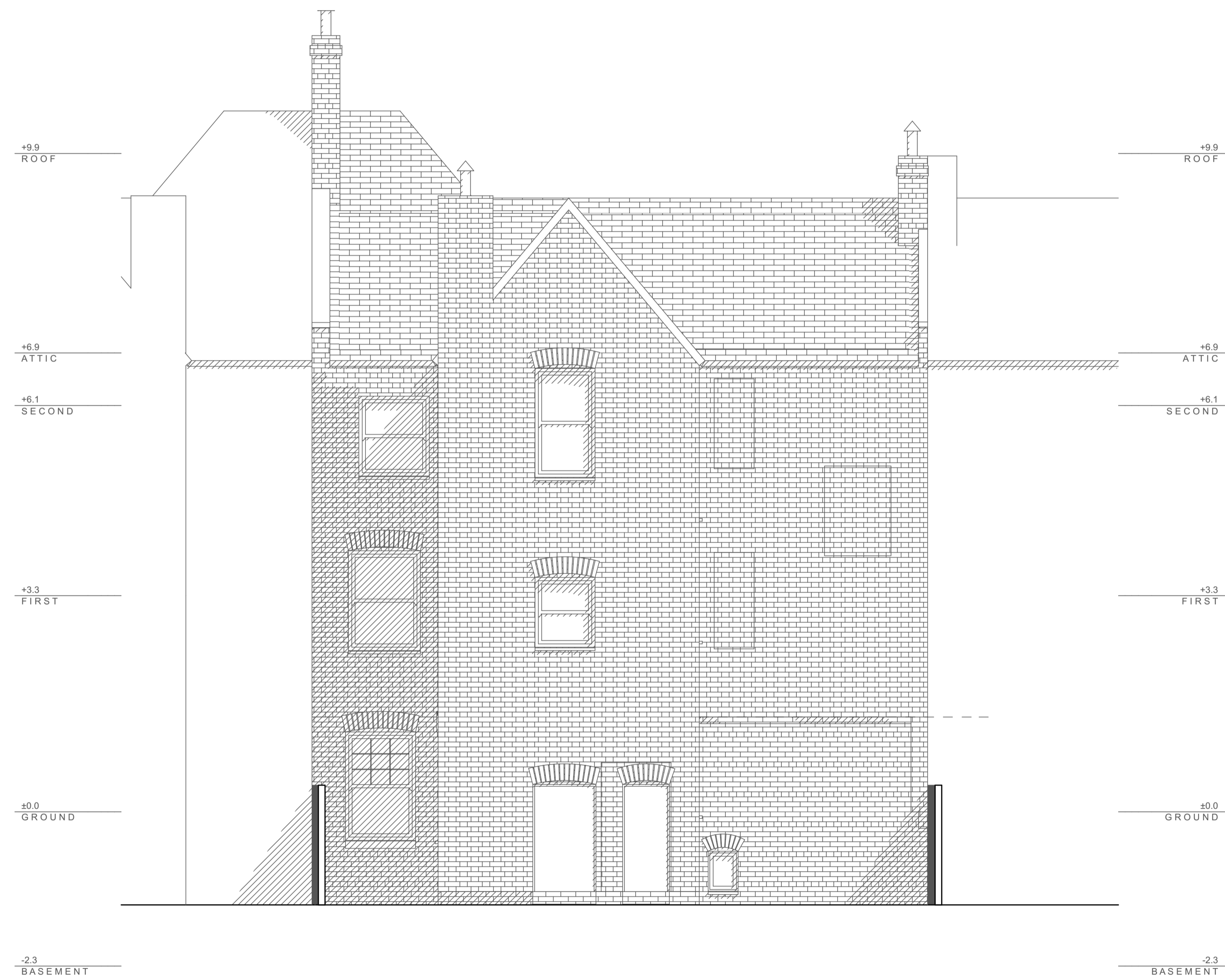
EXISTING SOUTH ELEVATION 1:50