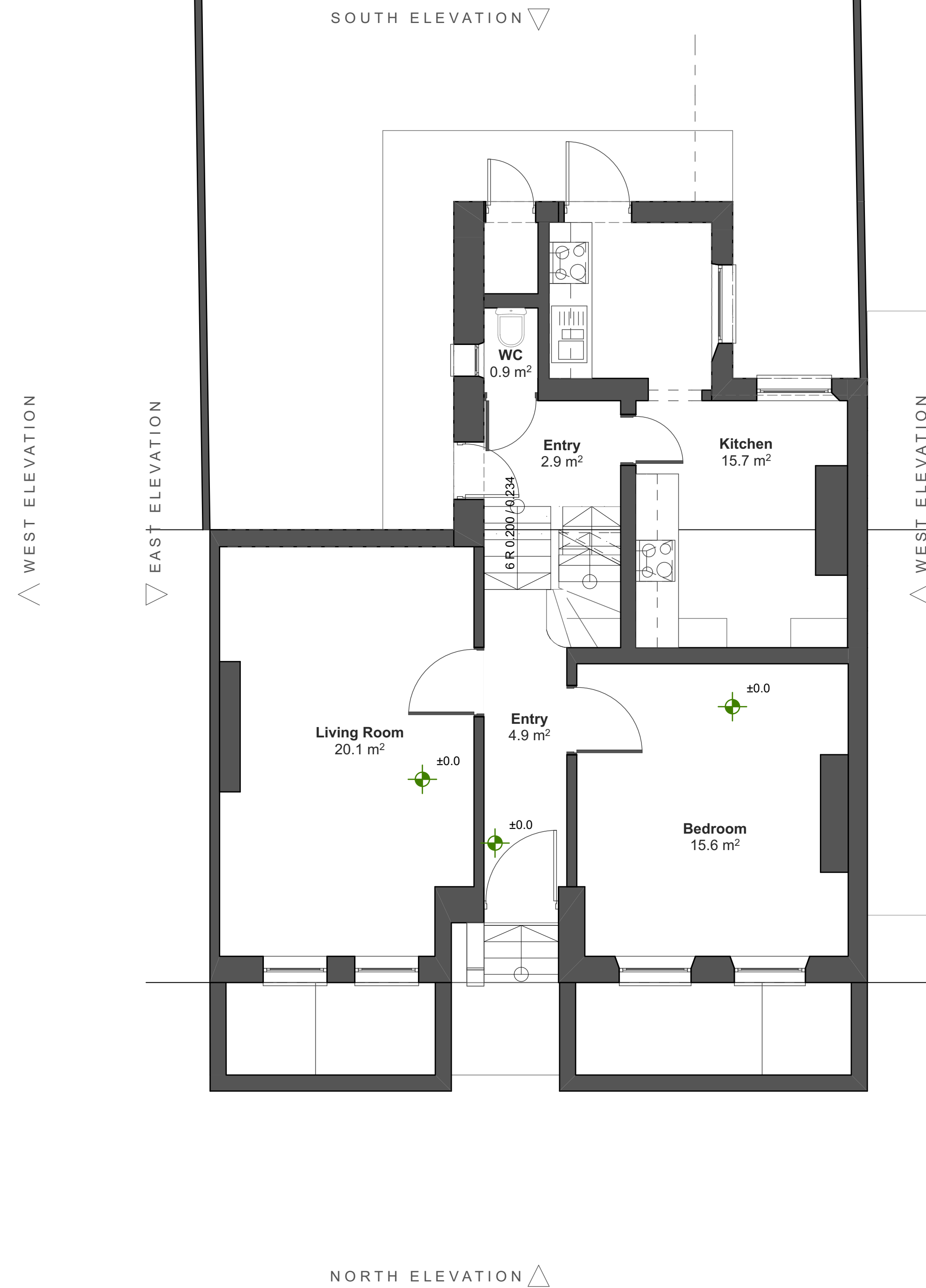
EXISTING GROUND 1:50