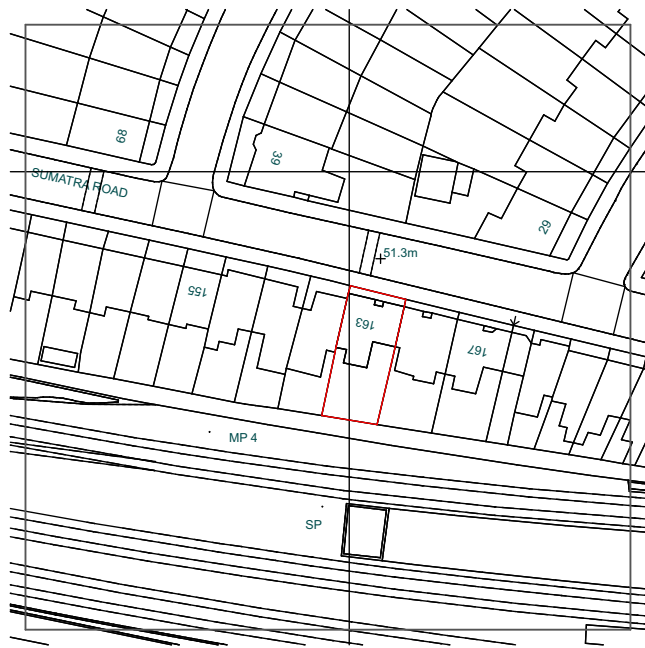
OS MAP 1:1250