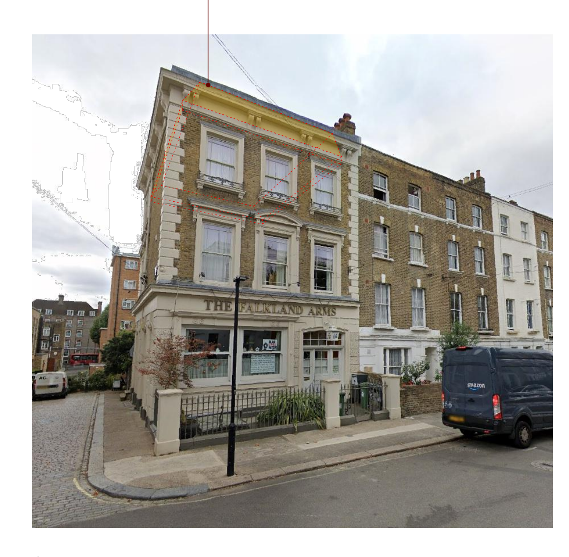
A VIEW FROM OPPOSITE SIDE OF FALKLAND ROAD - LOOKING TOWARDS 66 FALKLAND RD + WILLINGHAM TERRACE

BROKEN LINE INDICATES OUTLINE OF THE PROPOSED MANSARD ROOF BEHIND – THE PROPOSED RAISED PARAPET