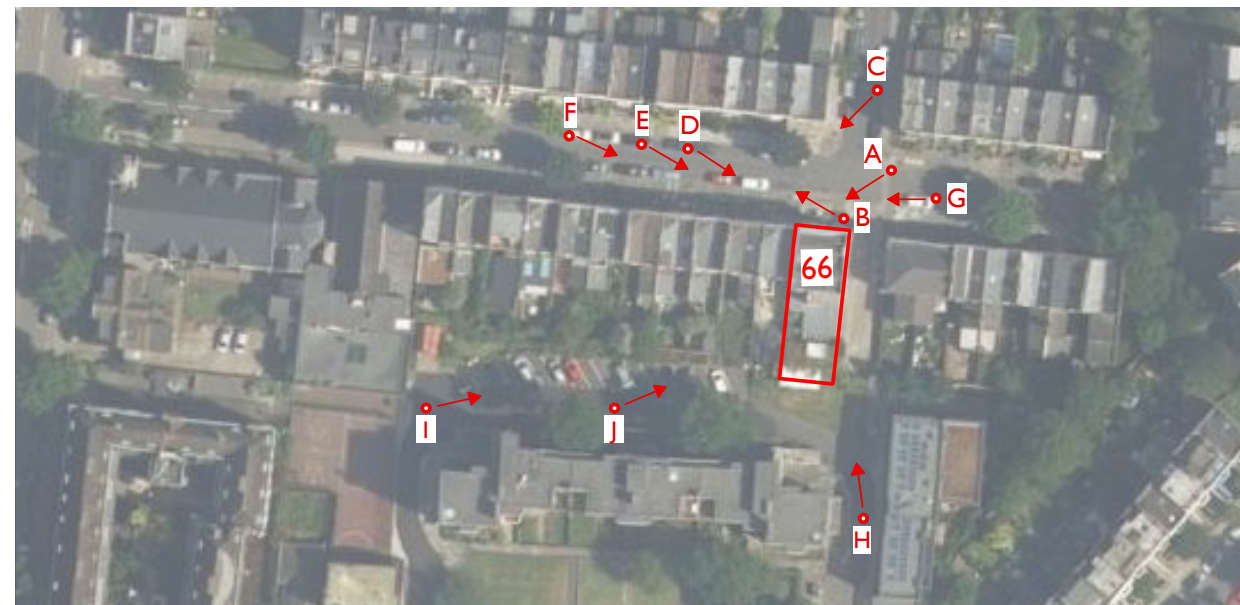
PHOTOGRAPHS LOCATION PLAN