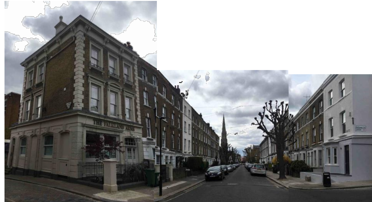
G VIEW FROM THE EAST OF FALKLAND ROAD - TOWARDS FALKLAND RD + WILLINGHAM TERRACE