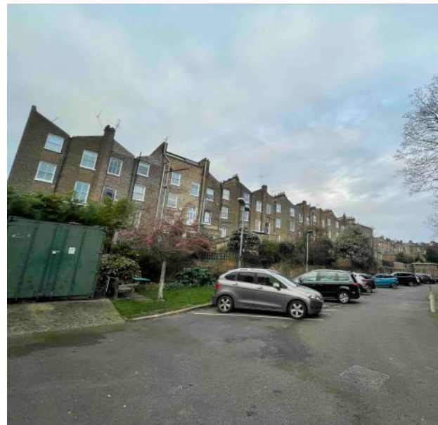
I VIEW FROM WILLINGHAM TERRACE - LOOKING TOWARDS THE REAR OF 66 FALKLAND RD