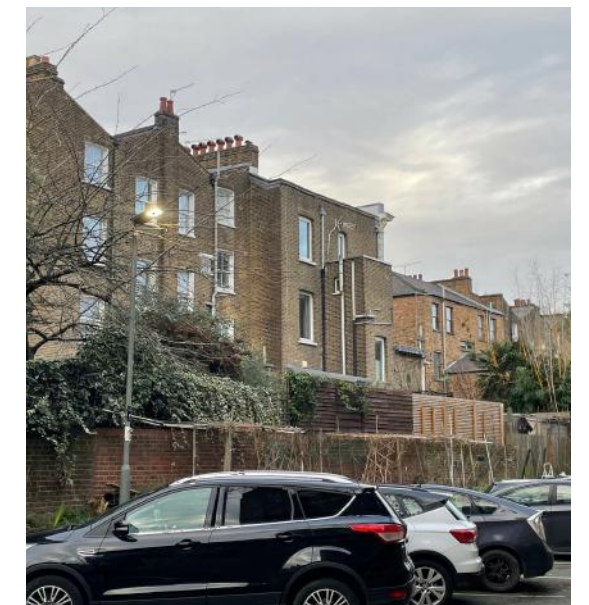
J VIEW FROM WILLINGHAM TERRACE - LOOKING TOWARDS THE REAR OF 66 FALKLAND RD

Notes: Drawings to be read in conjunction with all consultants information. Do not scale from the drawing. All dimensions to be checked on site. Drawing only to be used for purposes indicated. Notify A P T Architects + Designers Ltd of any discrepancies. This drawing is copyright of A P T Architects + Designers Ltd and not to be used or reproduced without their express permission in writing.