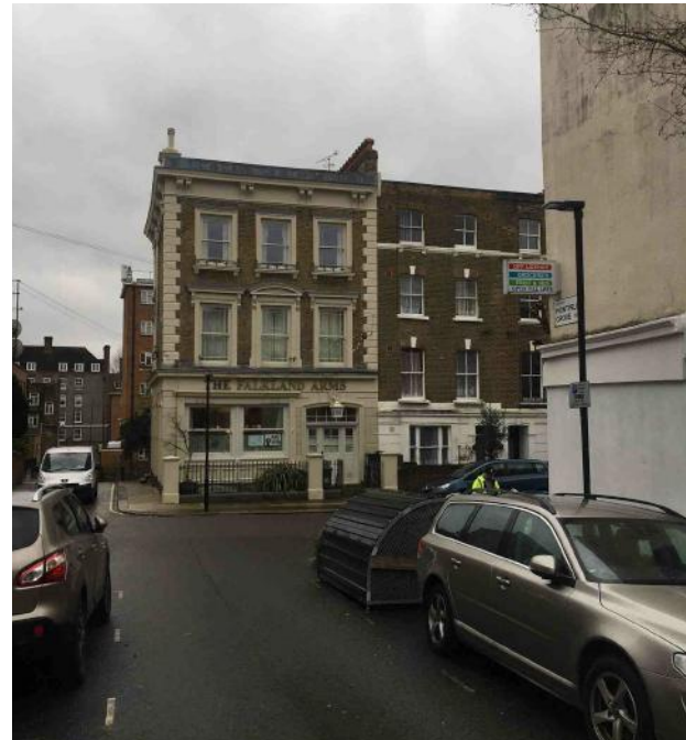
C VIEW FROM MONTPELLIER GROVE - LOOKING TOWARDS 66 FALKLAND RD + WILLINGHAM TERRACE