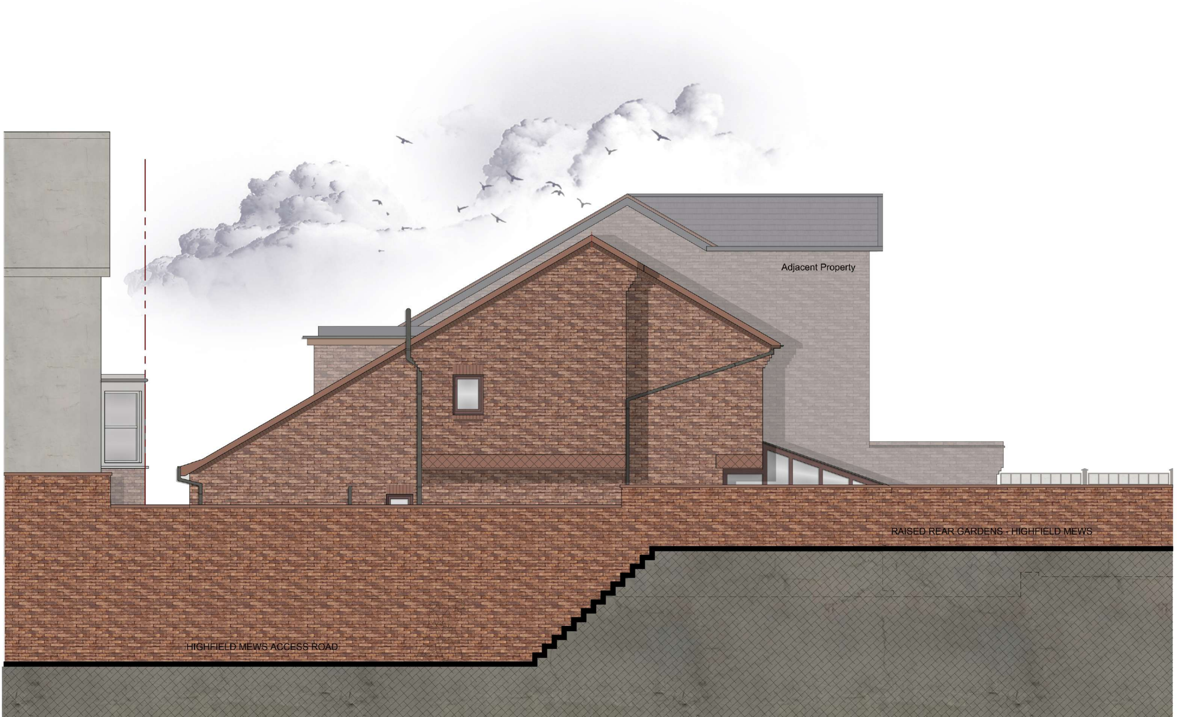
Sectional Elevation B - B'