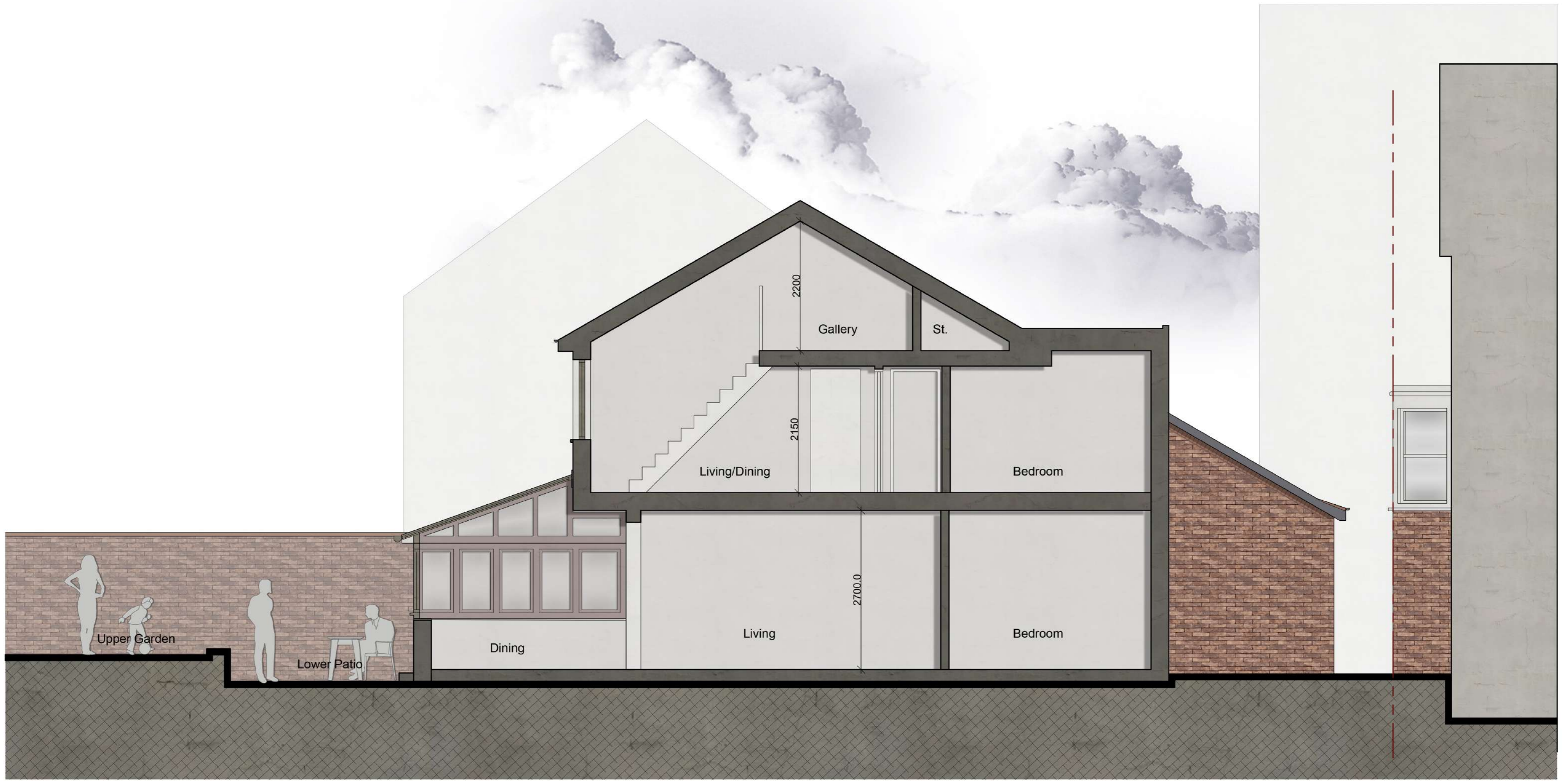
Sectional Elevation A - A'