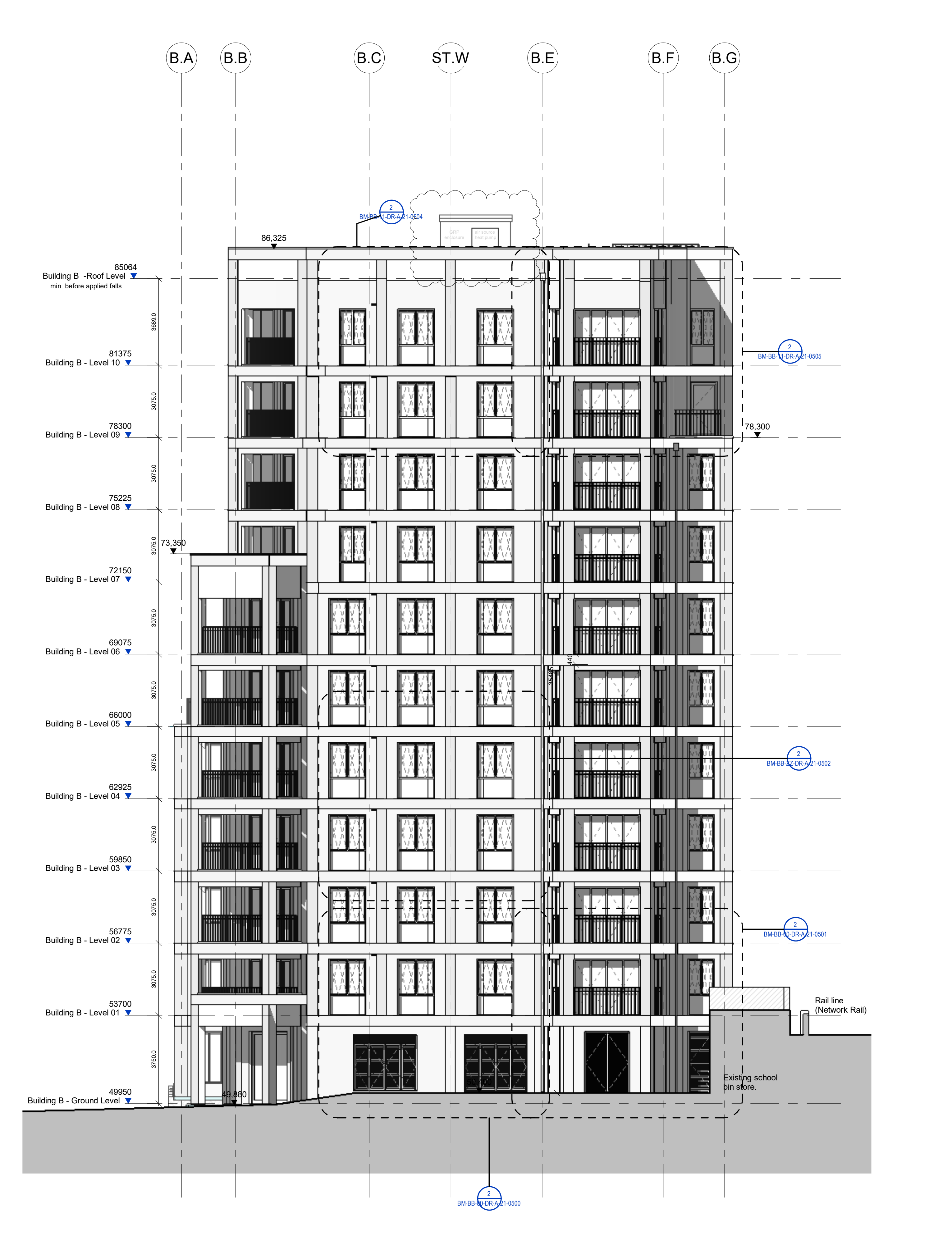
1 05 - Building B - East Elevation Scale 1:100