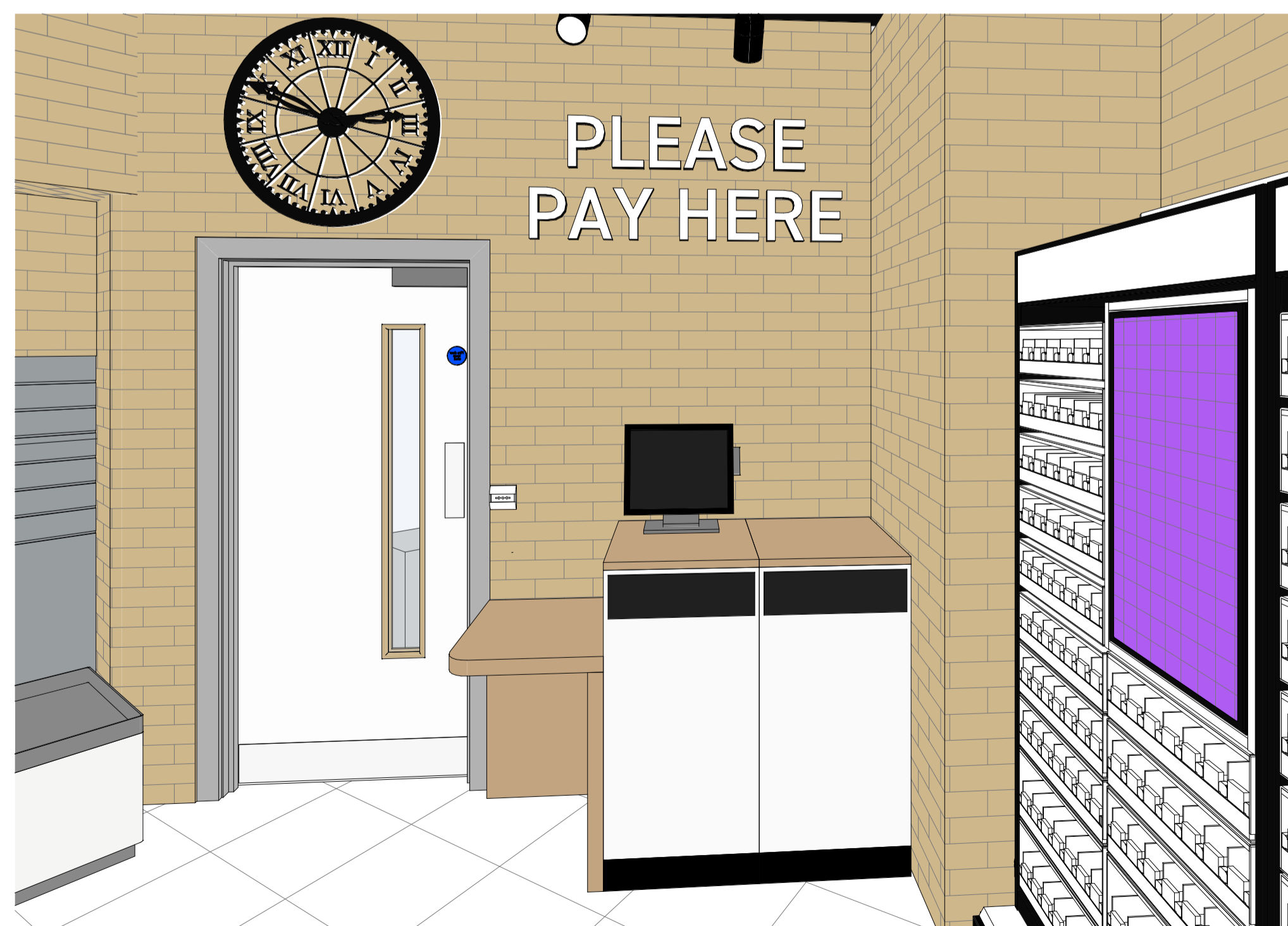
1 ELEVATION 8