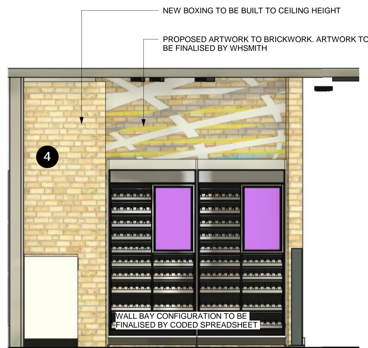
9 ELEVATION 9 1 : 25