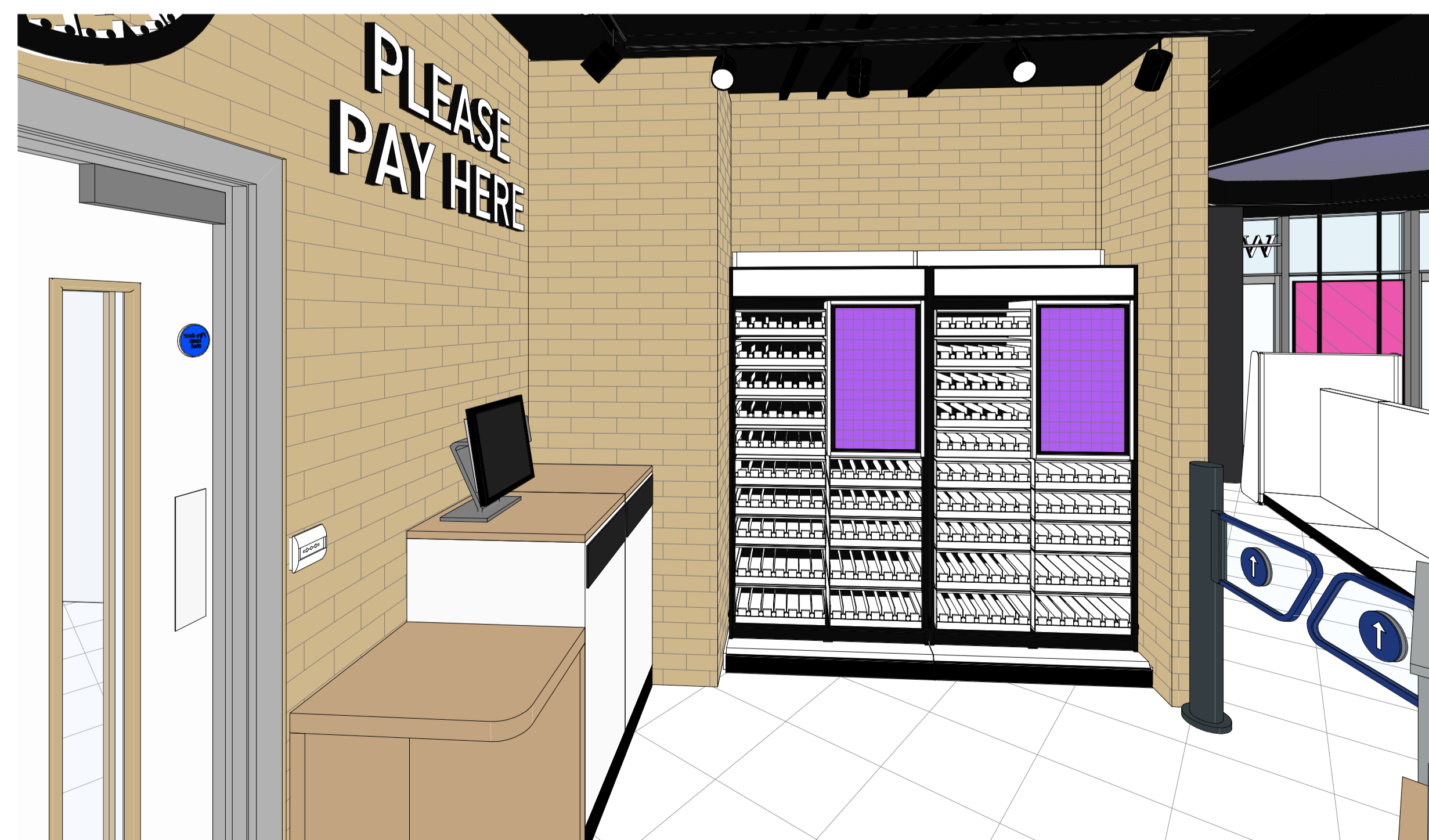
2 ELEVATION 9