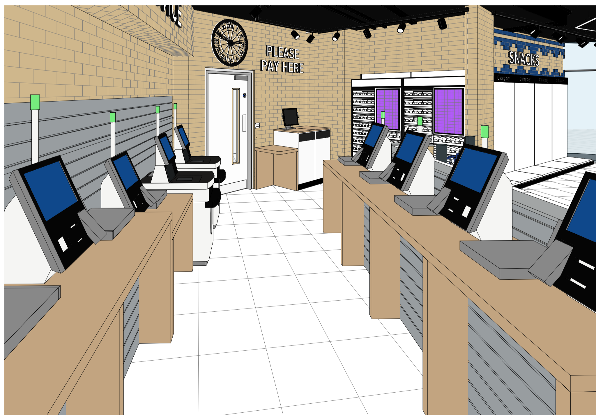
1 ELEVATION 5