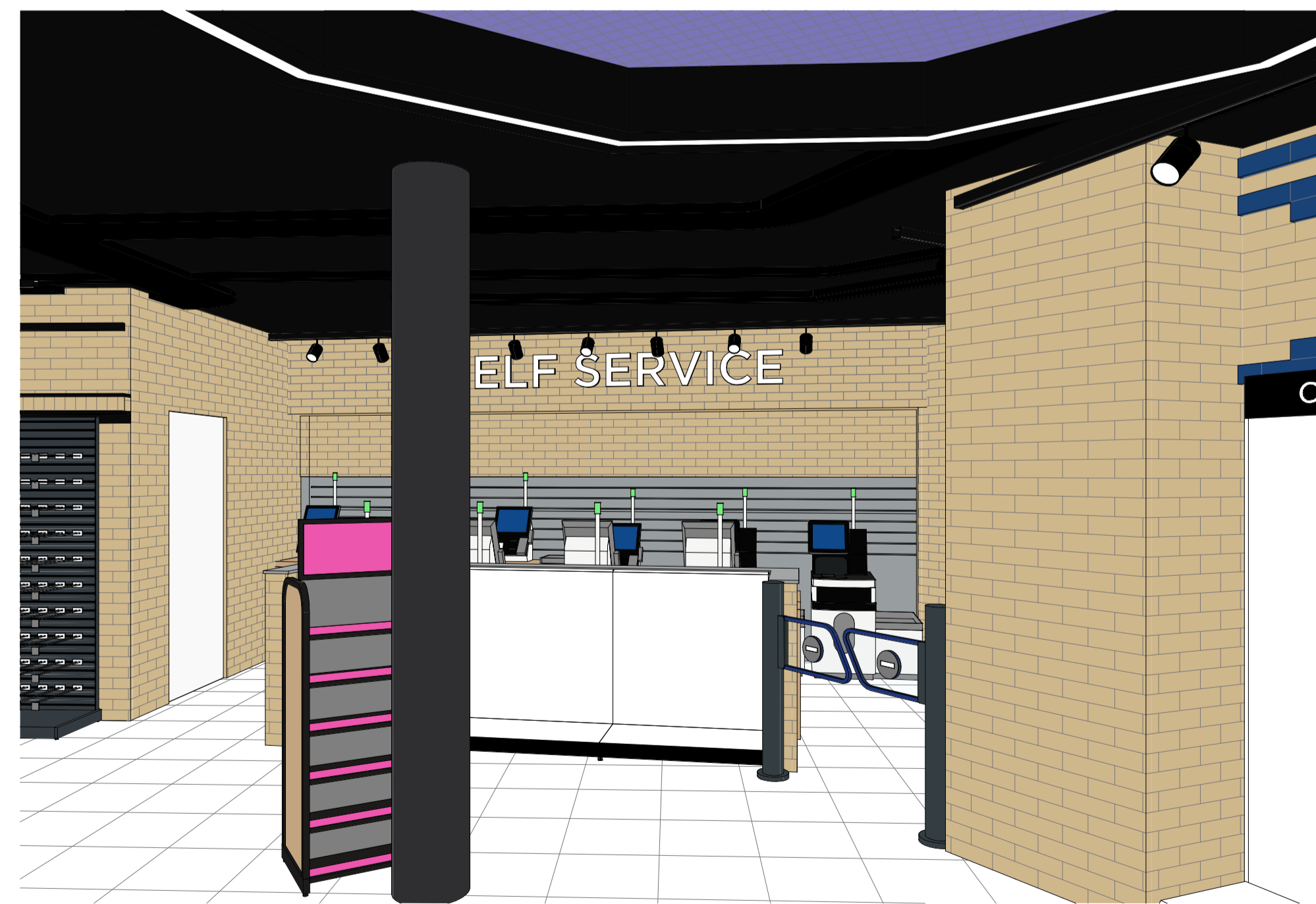
2 ELEVATION 6