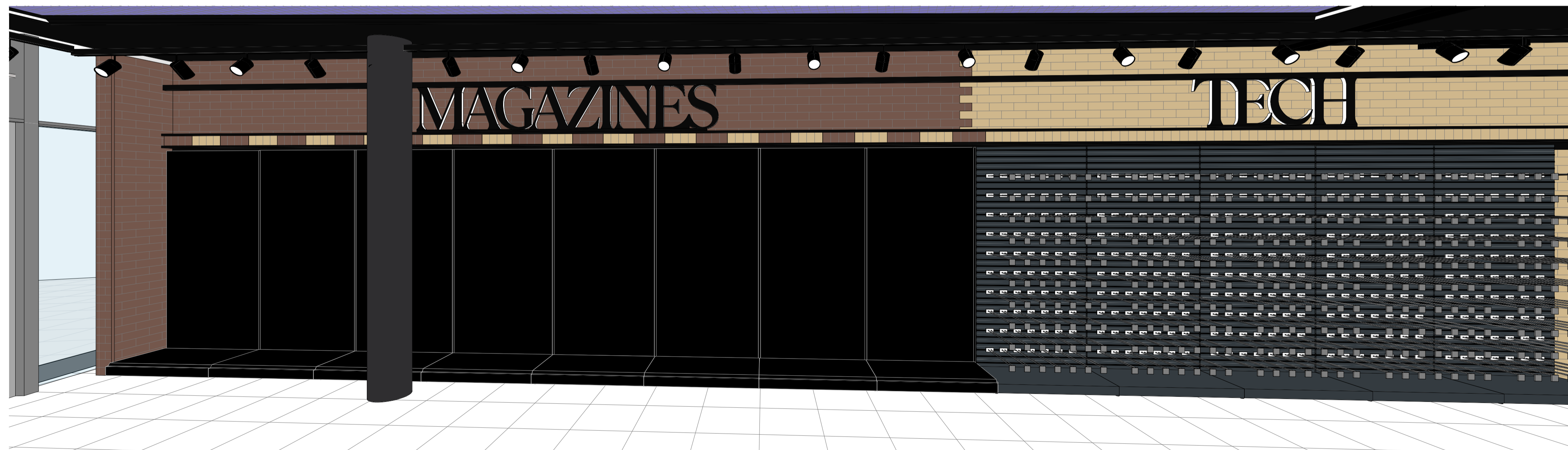
1 ELEVATION 4