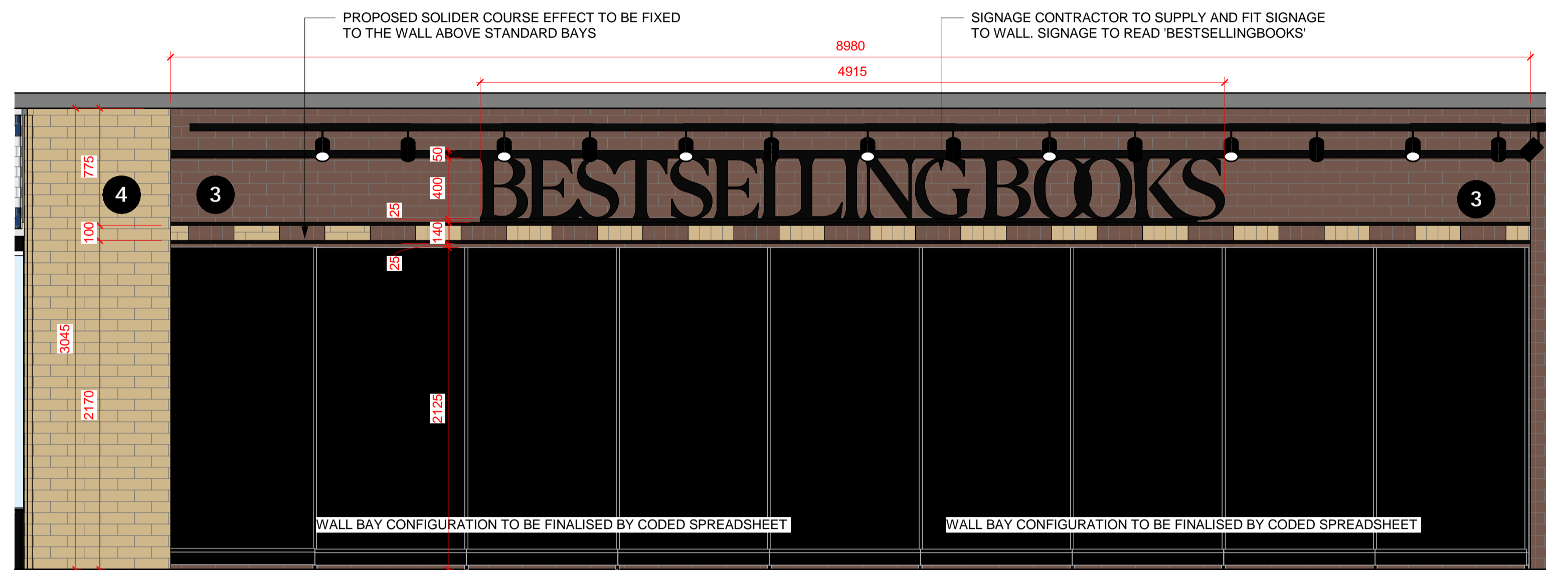
3 ELEVATION 3 1 : 25

NOTES ORIGINAL A1 THIS DRAWING IS COPYRIGHT OF BROOKER FLYNN ARCHITECTS LTD AND MAY NOT BE REPRODUCED IN ANY FORM OR TRANSFERRED TO OTHER PARTIES BY ELECTRONIC MEANS WITHOUT PRIOR WRITTEN CONSENT. NO DIMENSIONS TO BE SCALED FROM THIS DRAWING.