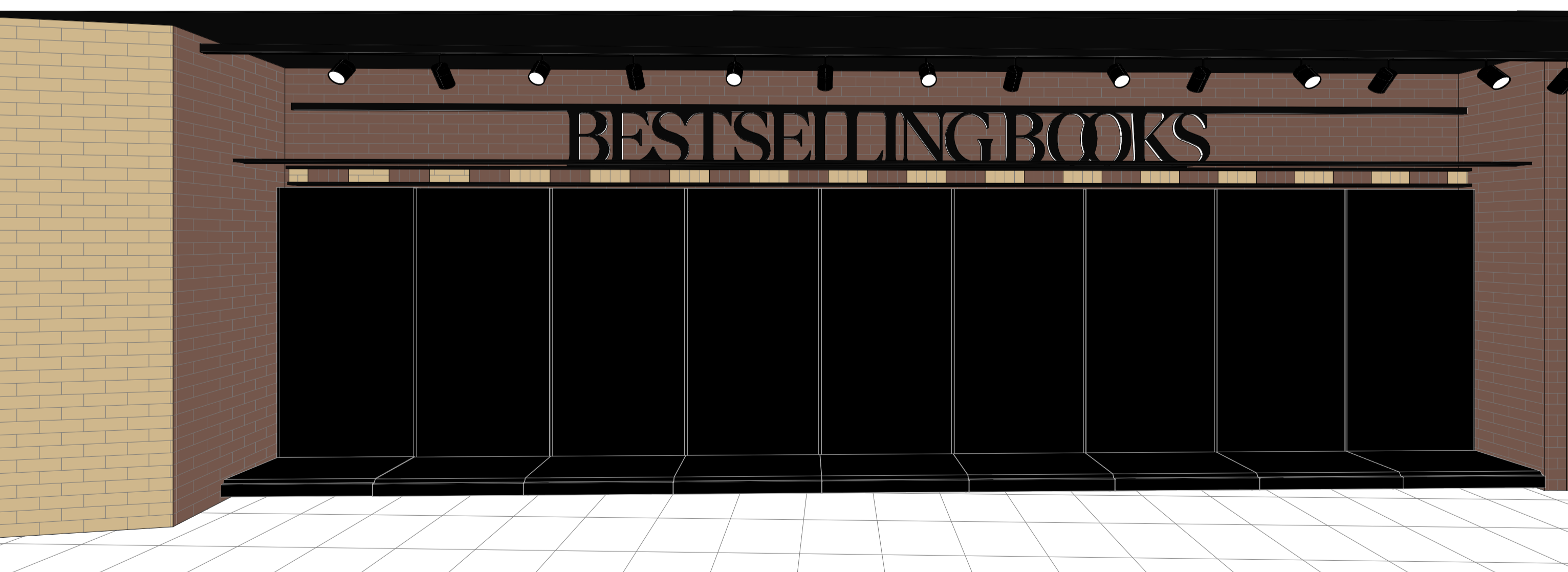
1 ELEVATION 3