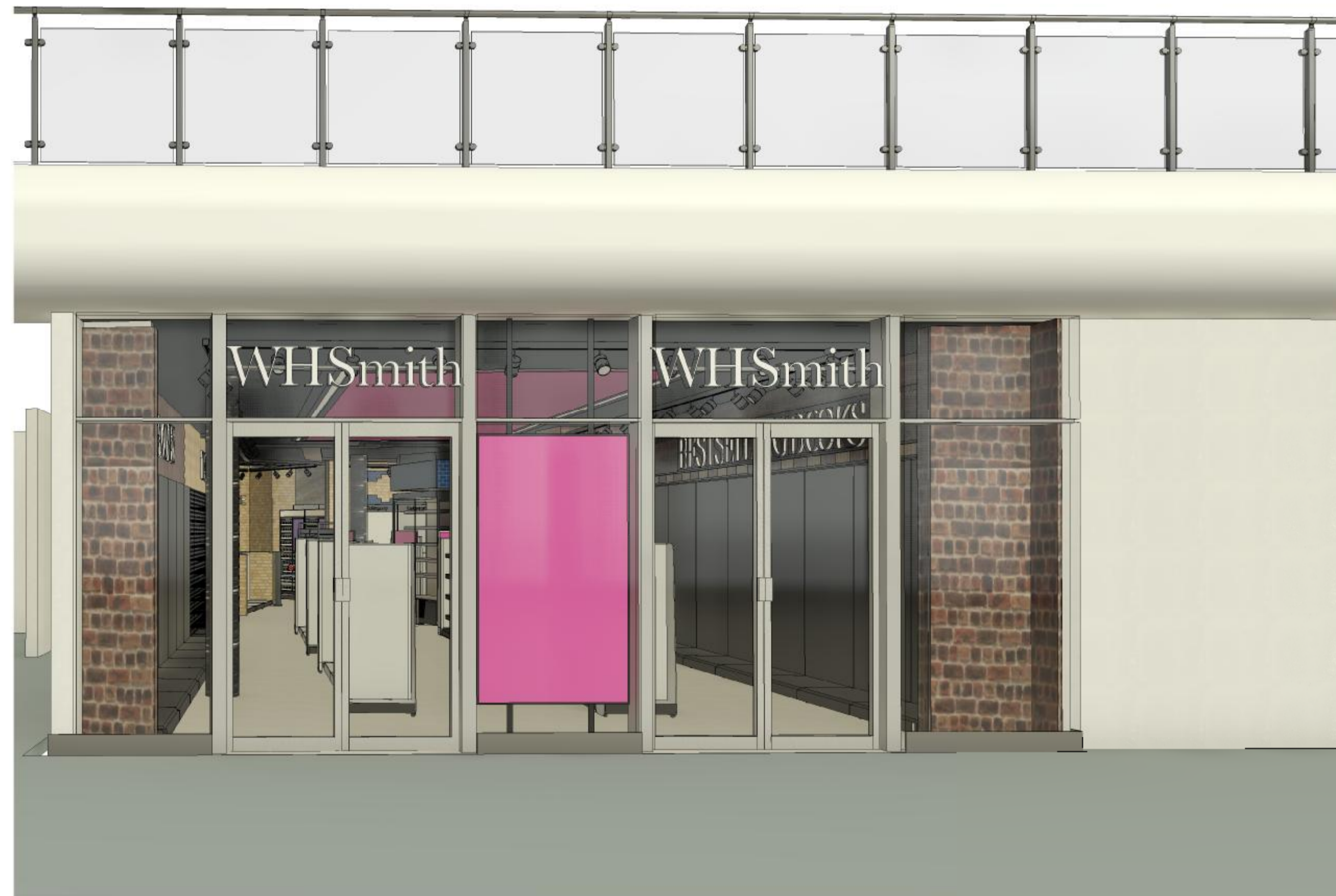
1 EXTERNAL ELEVATION 2