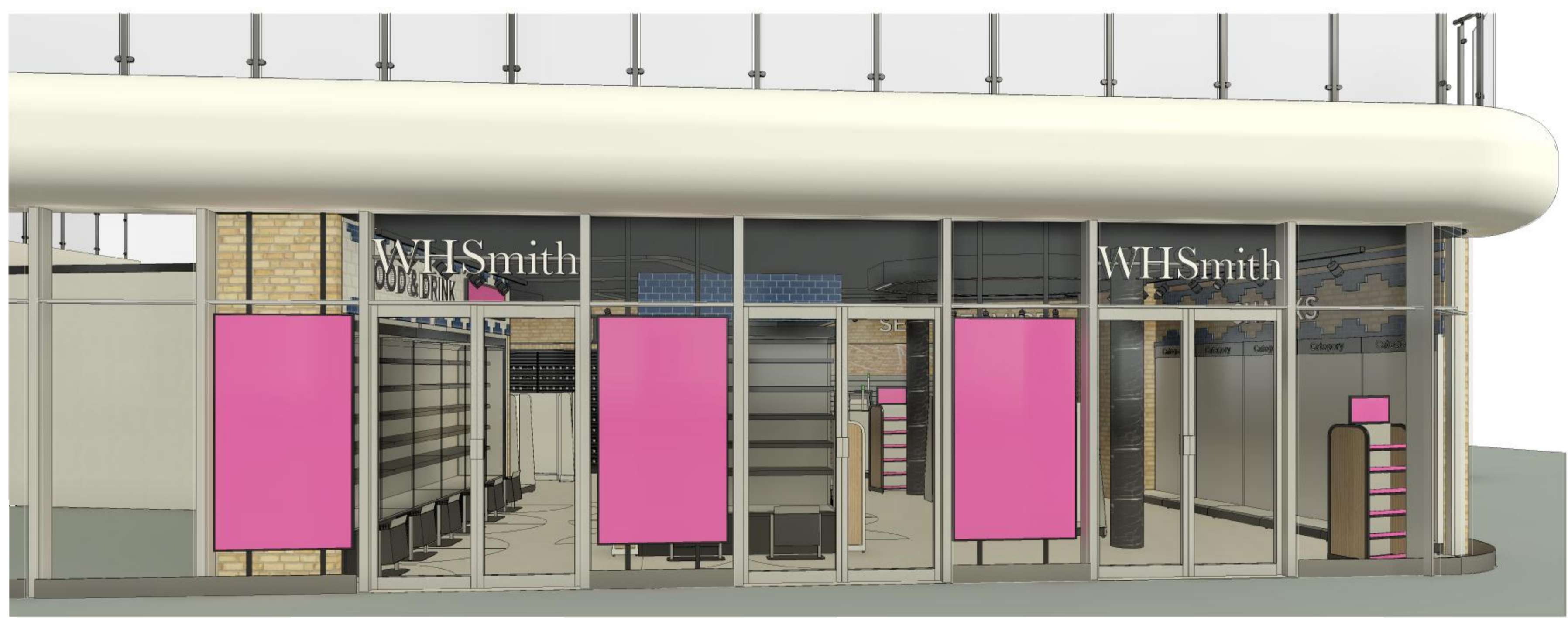
2 EXTERNAL ELEVATION 1